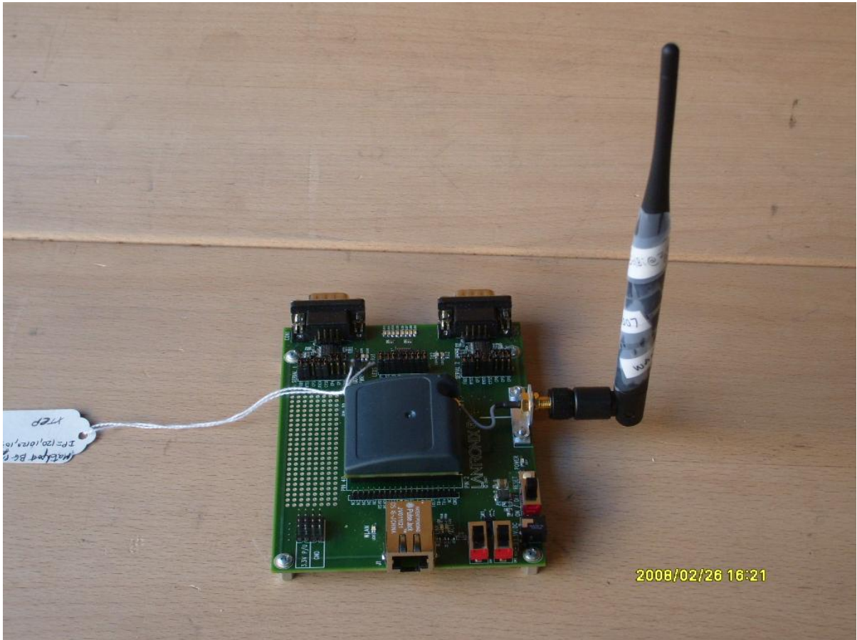
Top View – Test Board Ethernet Port