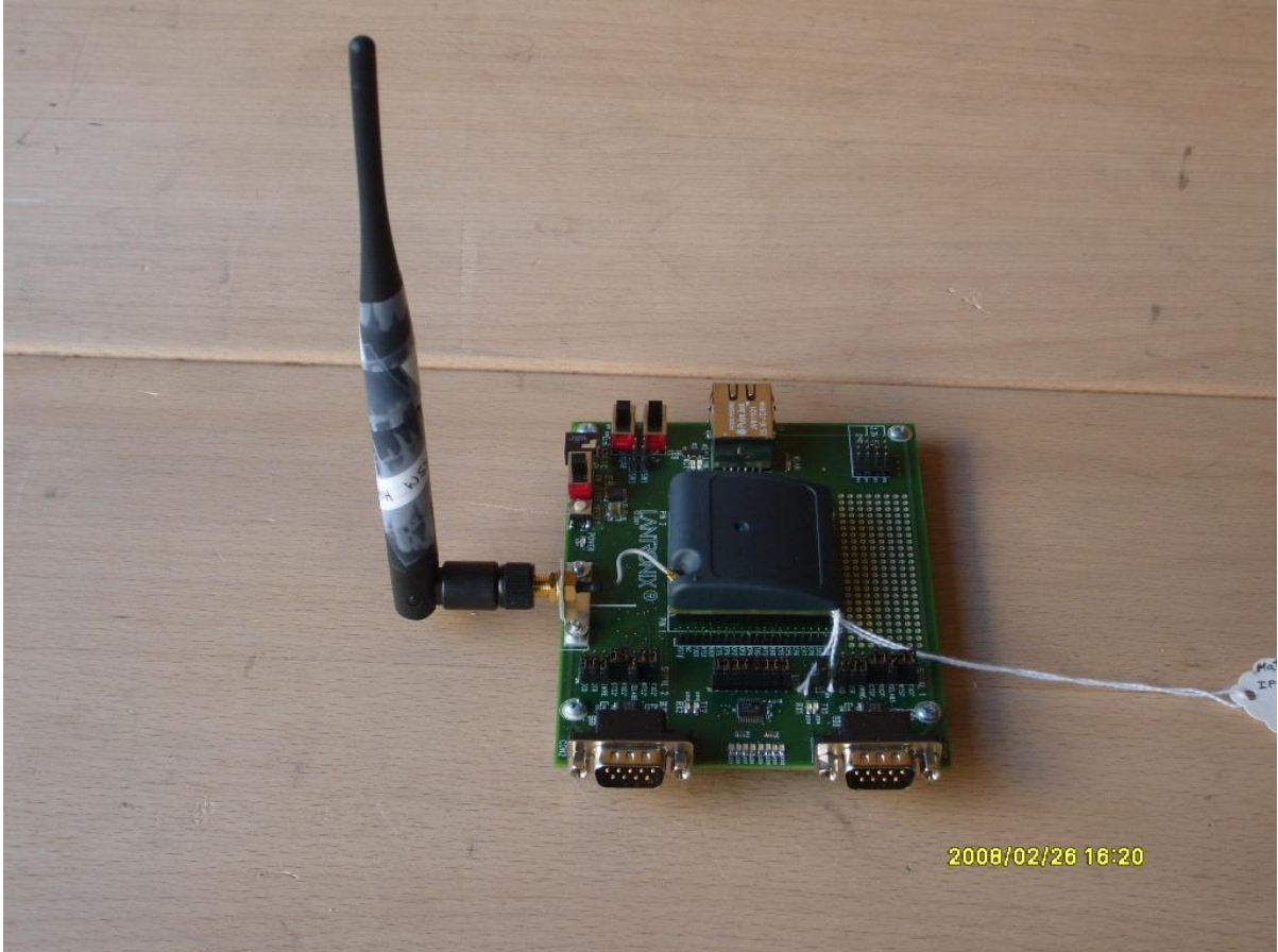
Top View – Test Board Serial Ports