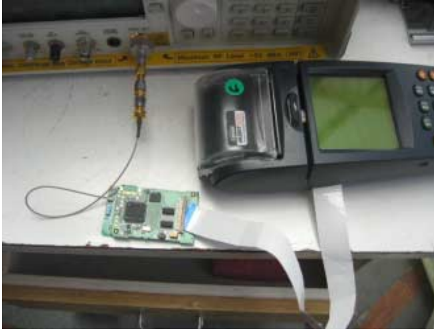
Photograph No.1 Peak output power at RF antenna connector test setup