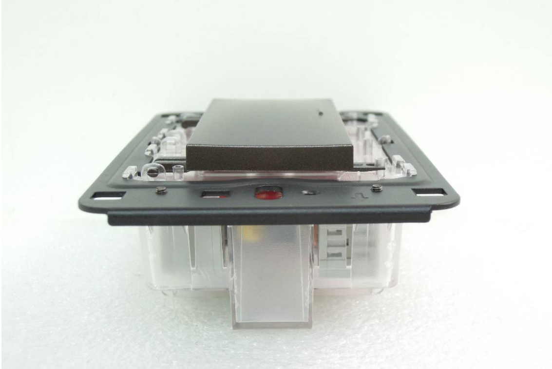
Side View of EUT - 4