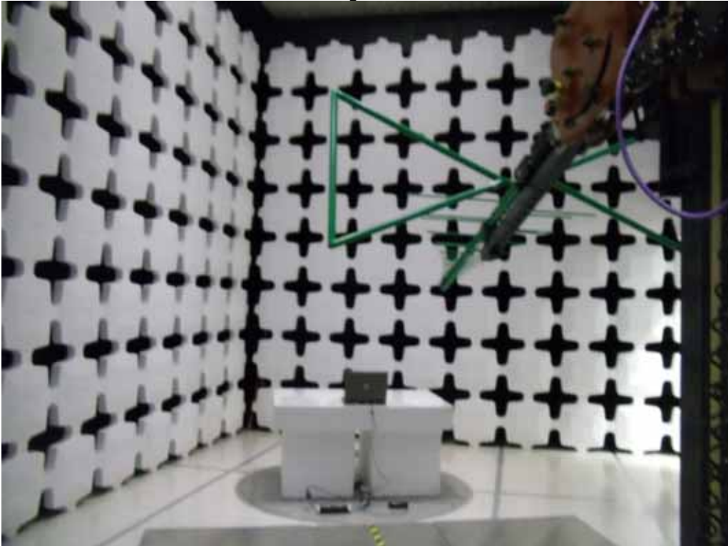
Test Setup for Radiated Emissions, 30MHz to 1GHz – Horizontal Polarization