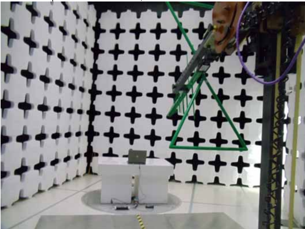
Test Setup for Radiated Emissions, 30MHz to 1GHz – Vertical Polarization