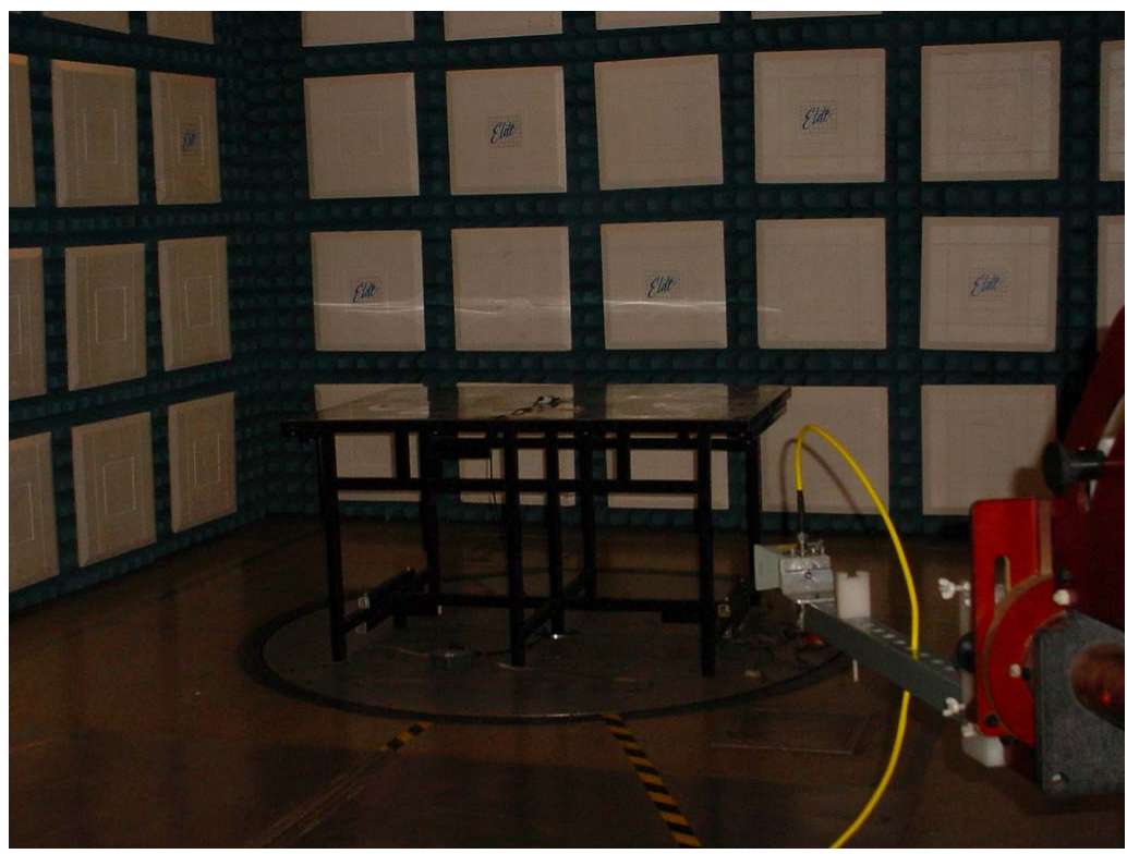
Test Set-up for Radiated Emissions – Vertical Polarization