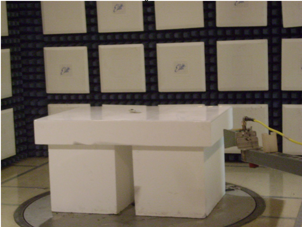
Test Setup for Radiated Emissions – 2GHz to 18GHz, Vertical Polarization