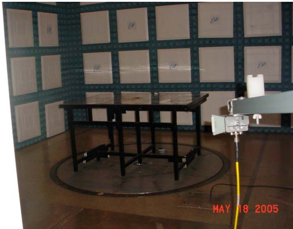
Test Set-up for Radiated Emissions – Vertical Polarization