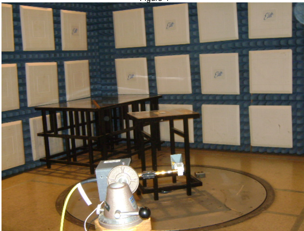
Test Setup for Radiated Emissions above 18GHz – Horizontal Polarization