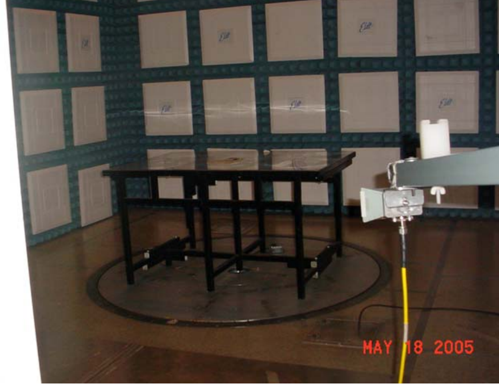
Test Setup for Radiated Emissions – Vertical Polarization

Test Setup for Radiated Emissions – Horizontal Polarization