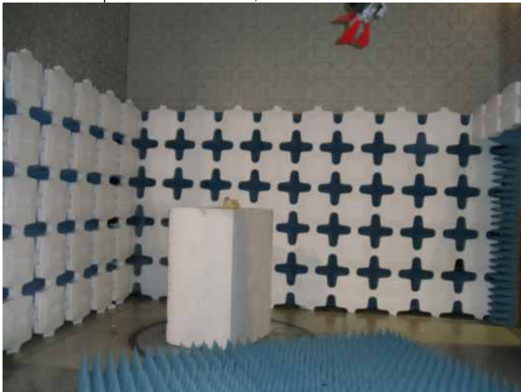
Test Setup for Radiated Emissions, 1 to 18GHz – Vertical Polarization