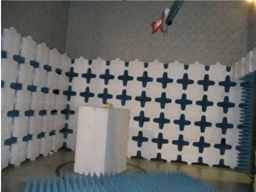
Test Setup for Radiated Emissions, 1 to 18GHz – Horizontal Polarization