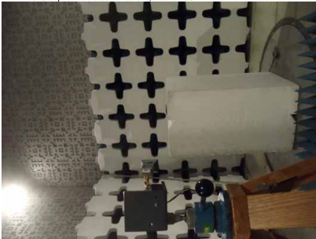
Test Setup for Radiated Emissions, Above 18GHz – Vertical Polarization