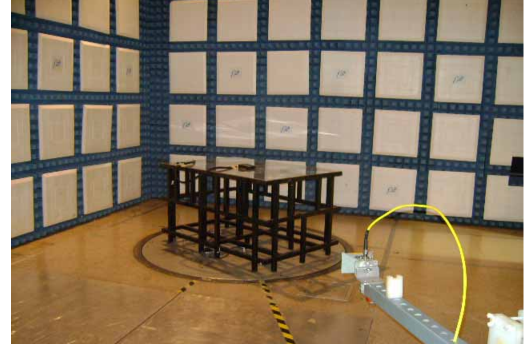
Test Setup for Radiated Emissions – Vertical Polarity