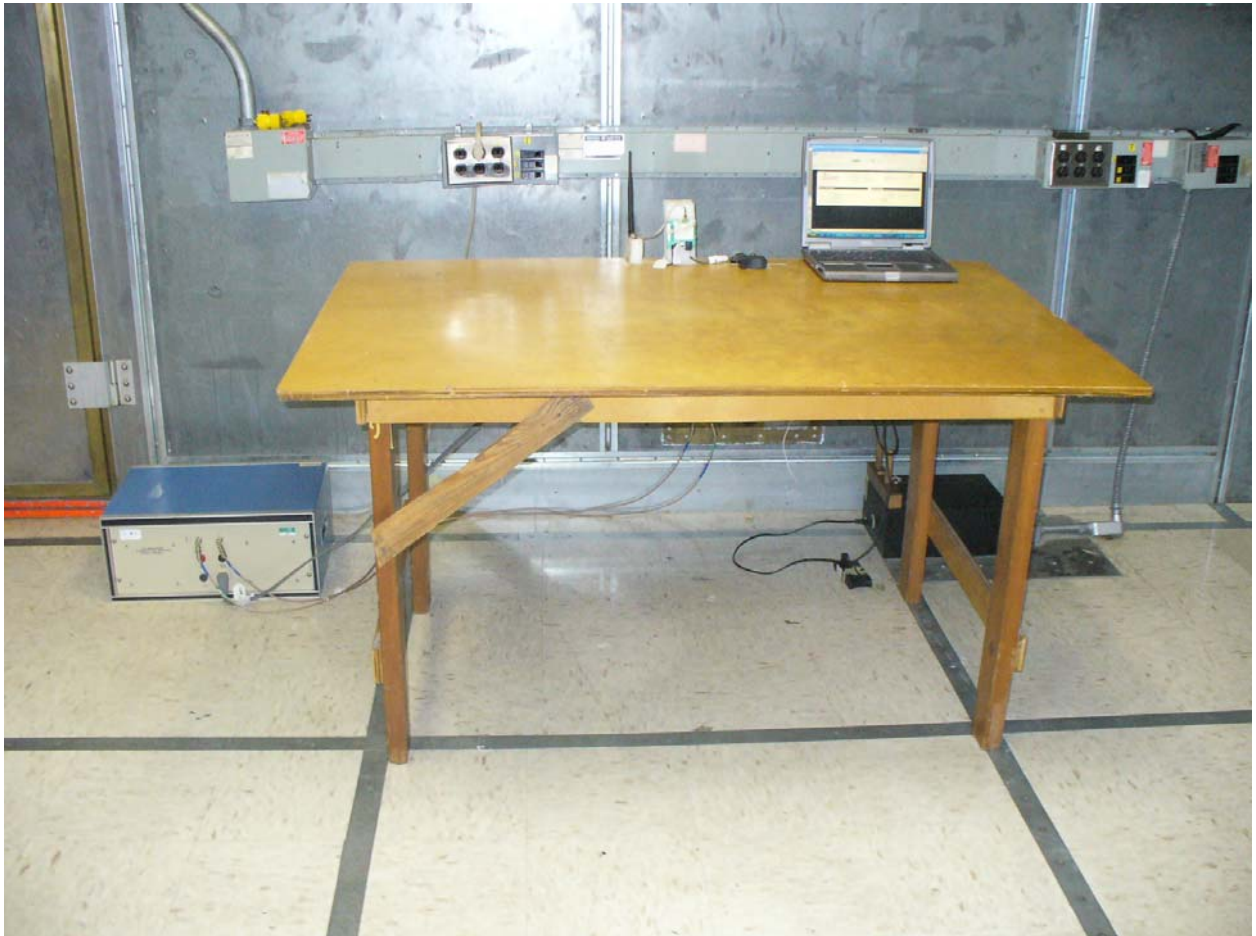
Figure 6: Power Line Conducted Emissions – EUT with Dipole Antenna (Front View)