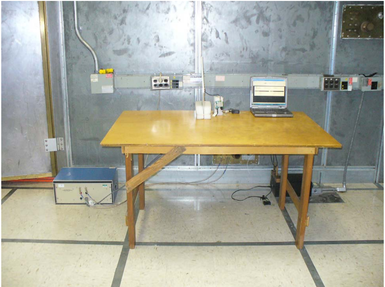
Figure 8: Power Line Conducted Emissions – EUT with Panel Antenna (Front View)