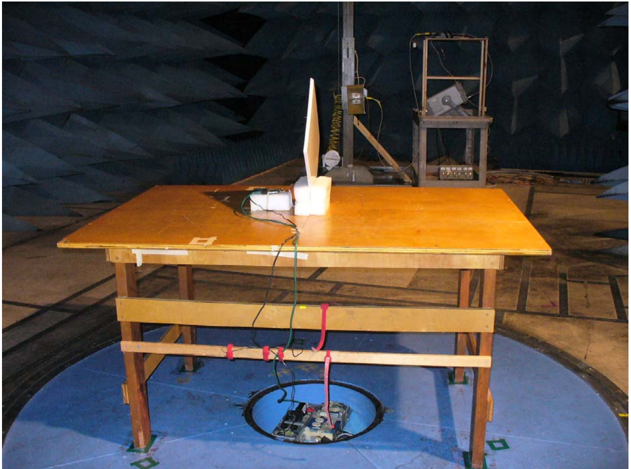
Figure 4: Radiated Emissions – EUT with Panel Antenna (Back View)