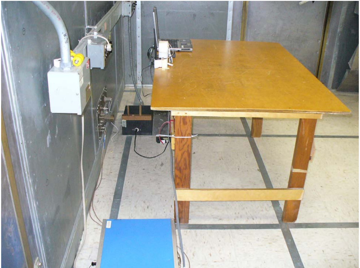
Figure 7: Power Line Conducted Emissions – EUT with Dipole Antenna (Side View)