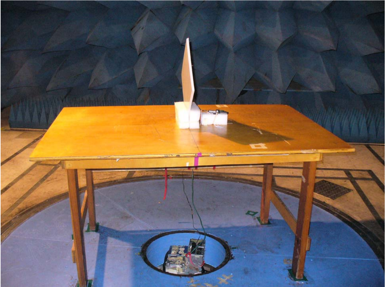
Figure 3: Radiated Emissions – EUT with Panel Antenna (Front View)