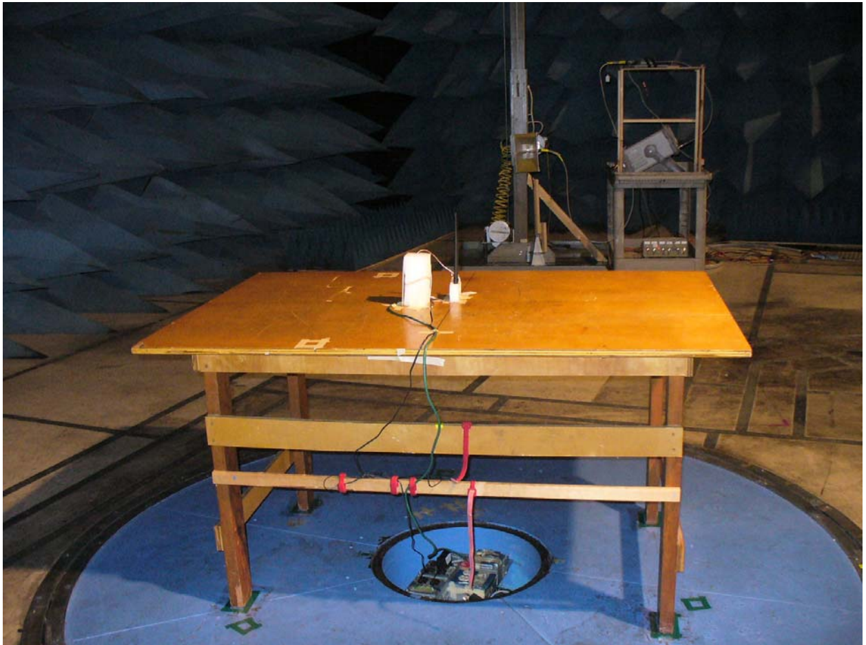
Figure 2: Radiated Emissions – EUT with Dipole Antenna (Back View)