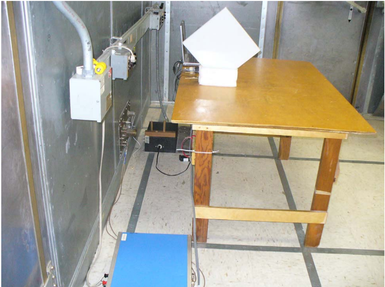
Figure 9: Power Line Conducted Emissions – EUT with Panel Antenna (Side View)