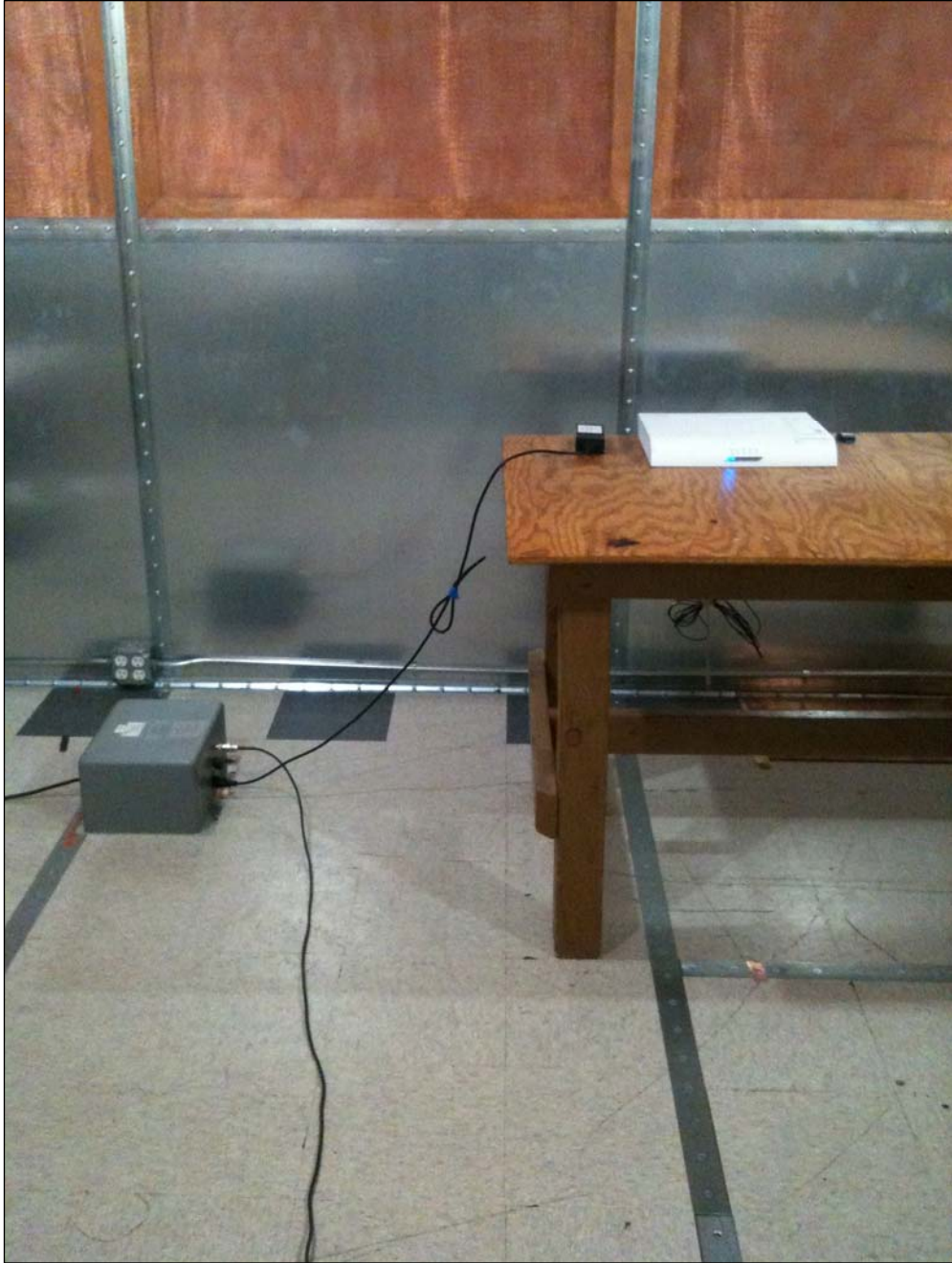
Photograph 1. Conducted Emissions, Test Setup