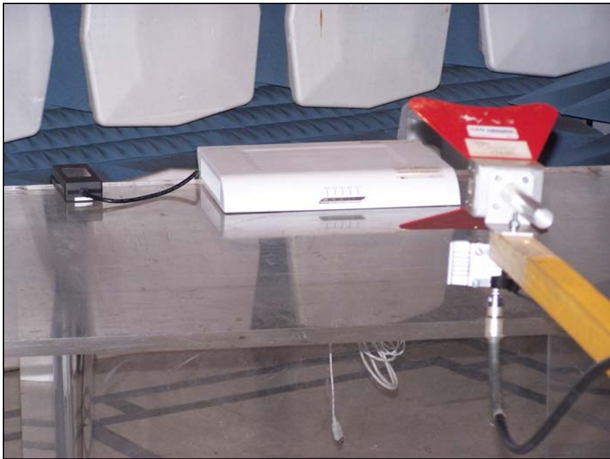
Photograph 3. Radiated Emission Limits, Test Setup, 1 GHz – 4 GHz