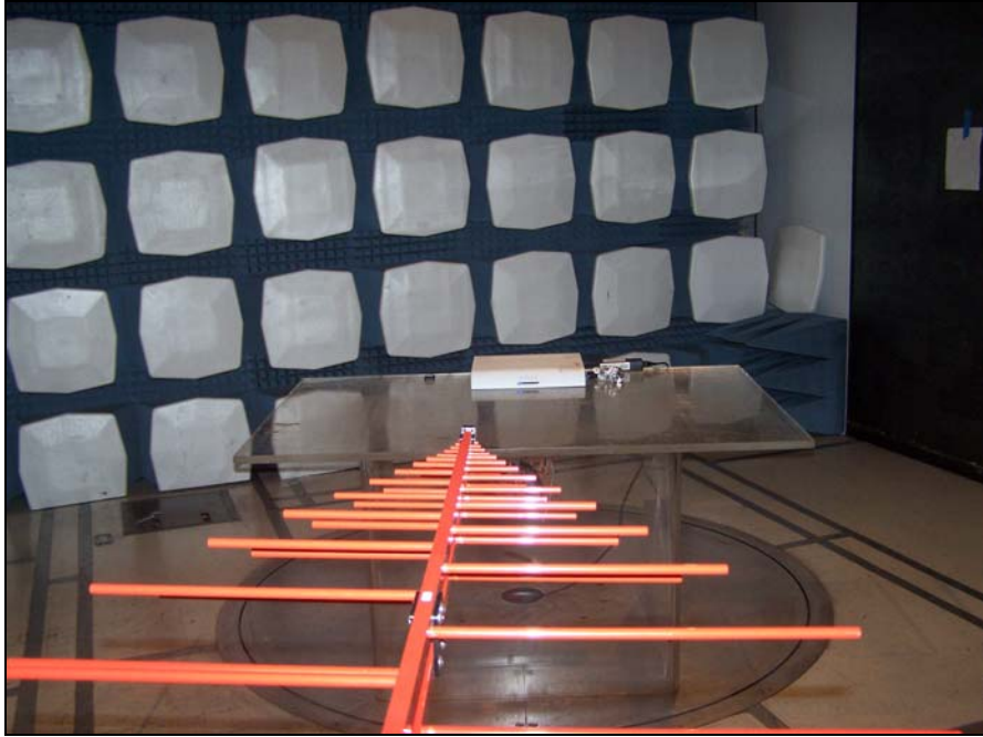
Photograph 2. Radiated Emission Limits, Test Setup, 30 MHz – 1 GHz