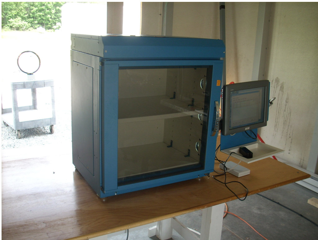
Fundamental Readings and Spurious Emissions 0.009 – 30MHz