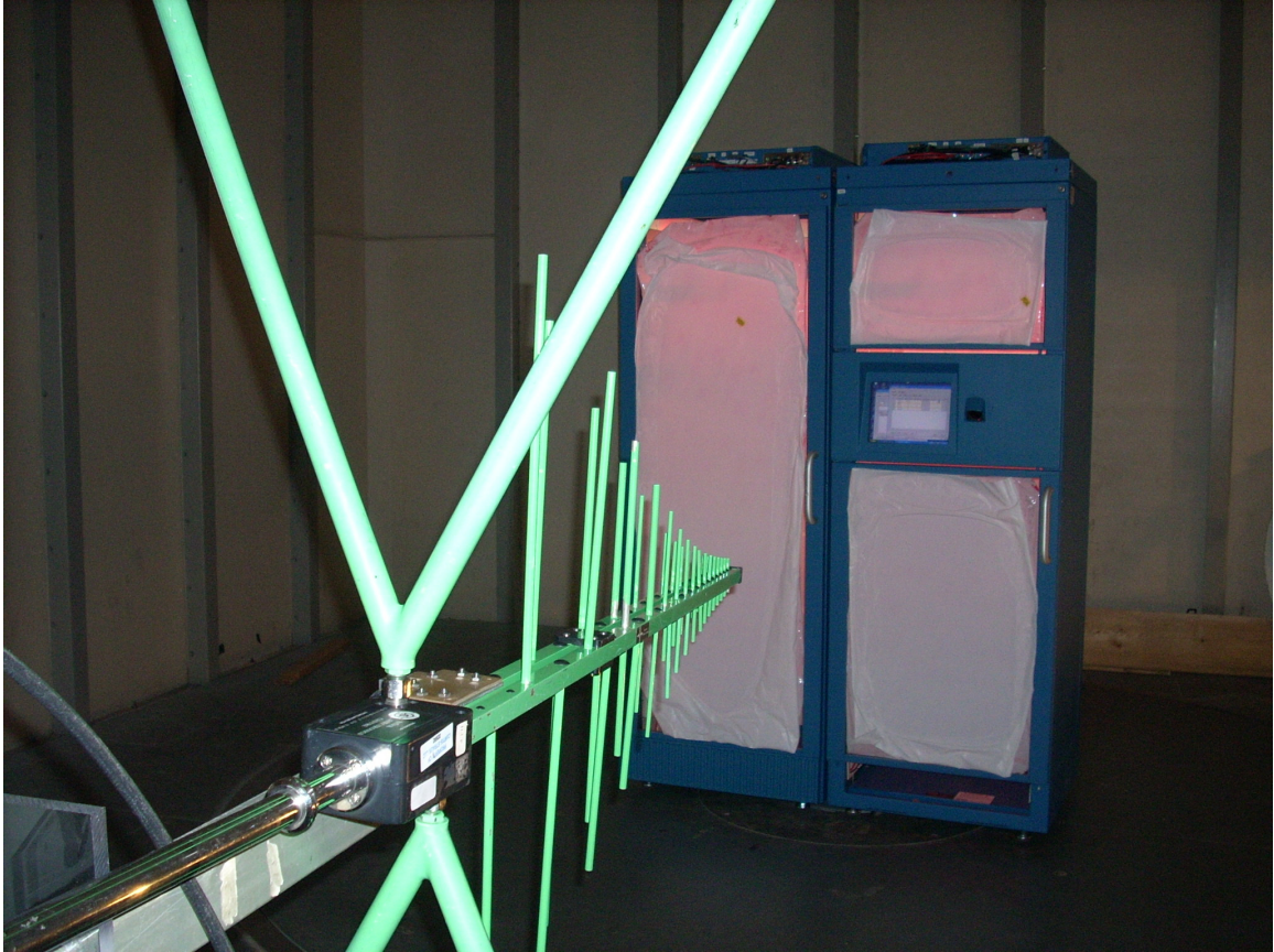
Radiated EMI 30 – 1000MHz range