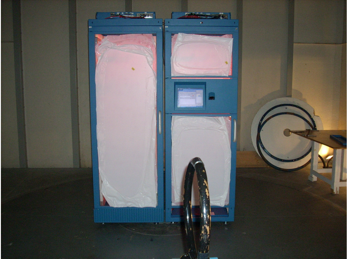
Radiated EMI Below 30MHz