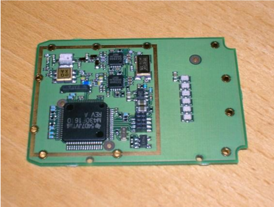
2. Top Side – Shield removed