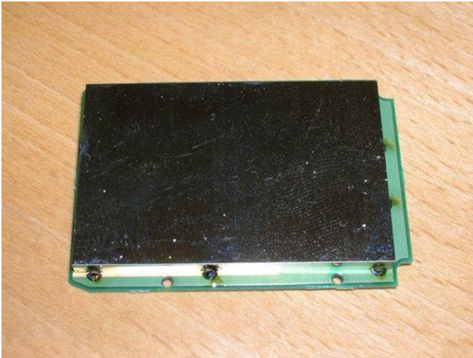
1. Top Side with Shield