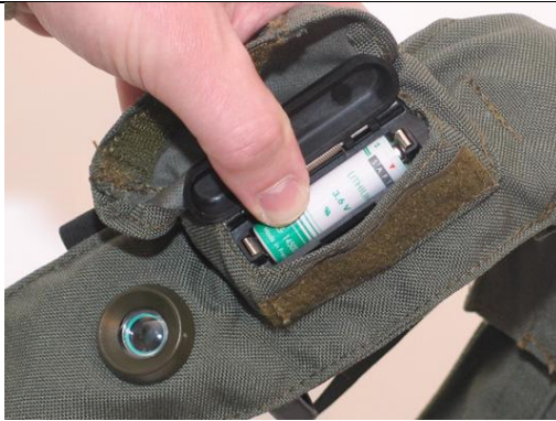
2. Install the battery in the head harness, if applicable.