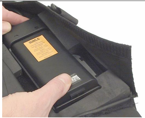
1b. Install the 2-cell battery in the body harness.