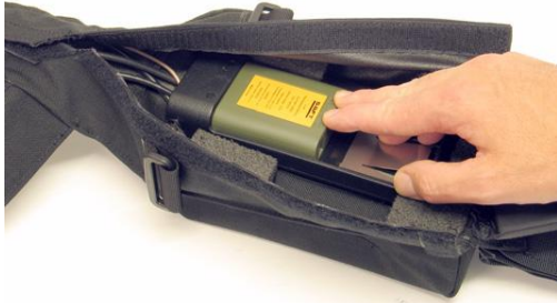
1a. Install the 1-cell battery in the body harness.