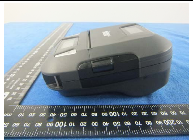
EUT - Right View(serial Model No.)