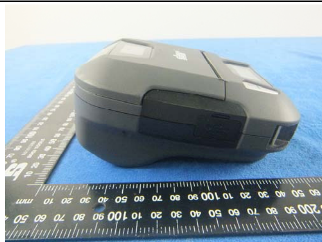
EUT - Left View(serial Model No.)