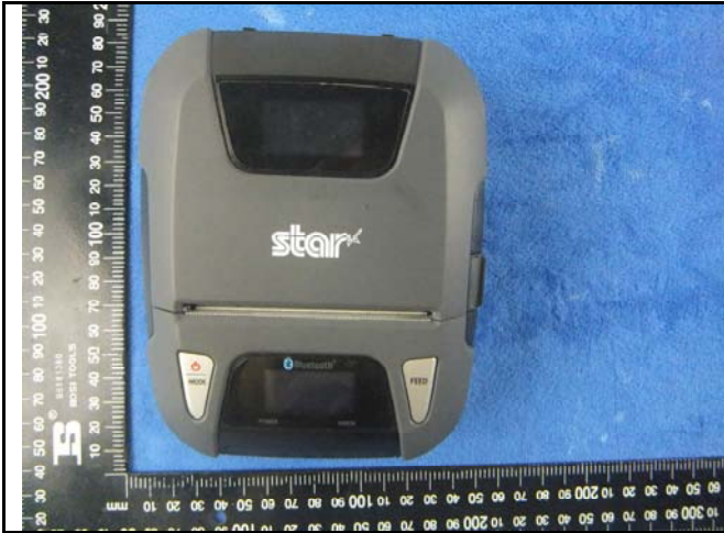
EUT - Front View(serial Model No.)