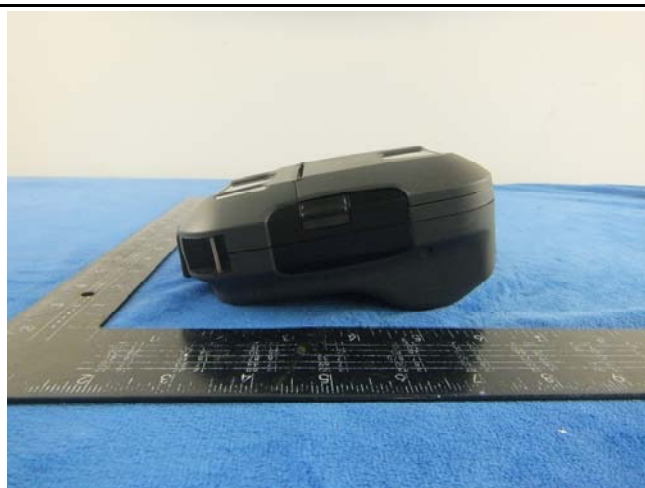
EUT - Right View(Main Model No.)