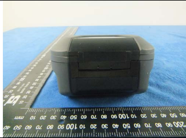
EUT - Top View(serial Model No.)