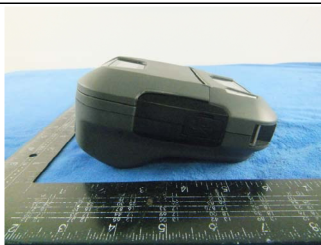
EUT - Left View(Main Model No.)