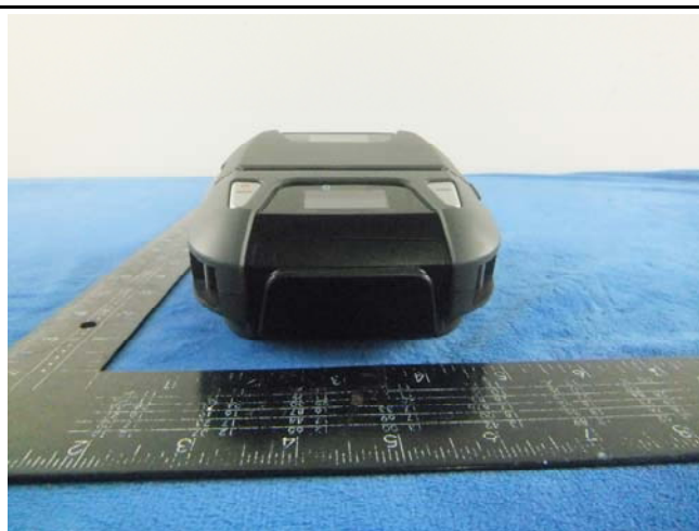
EUT - Bottom View(Main Model No.)