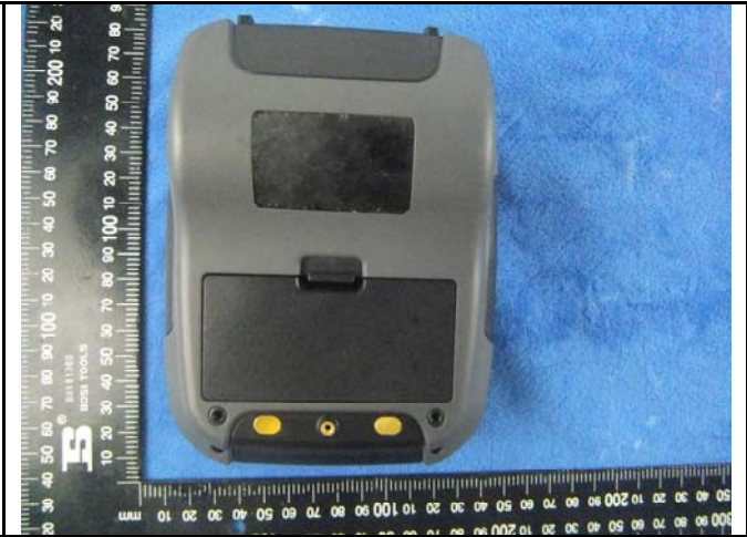
EUT - Rear View(serial Model No.)