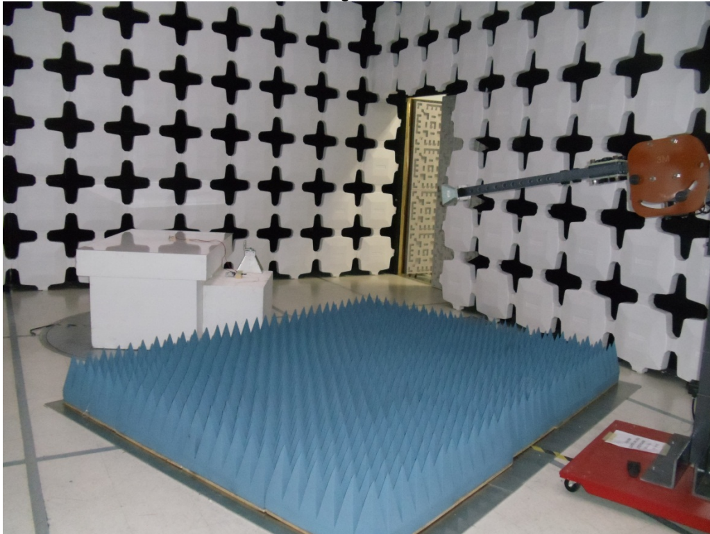
Test Setup for Radiated Emissions, Above 1GHz – Horizontal Polarization