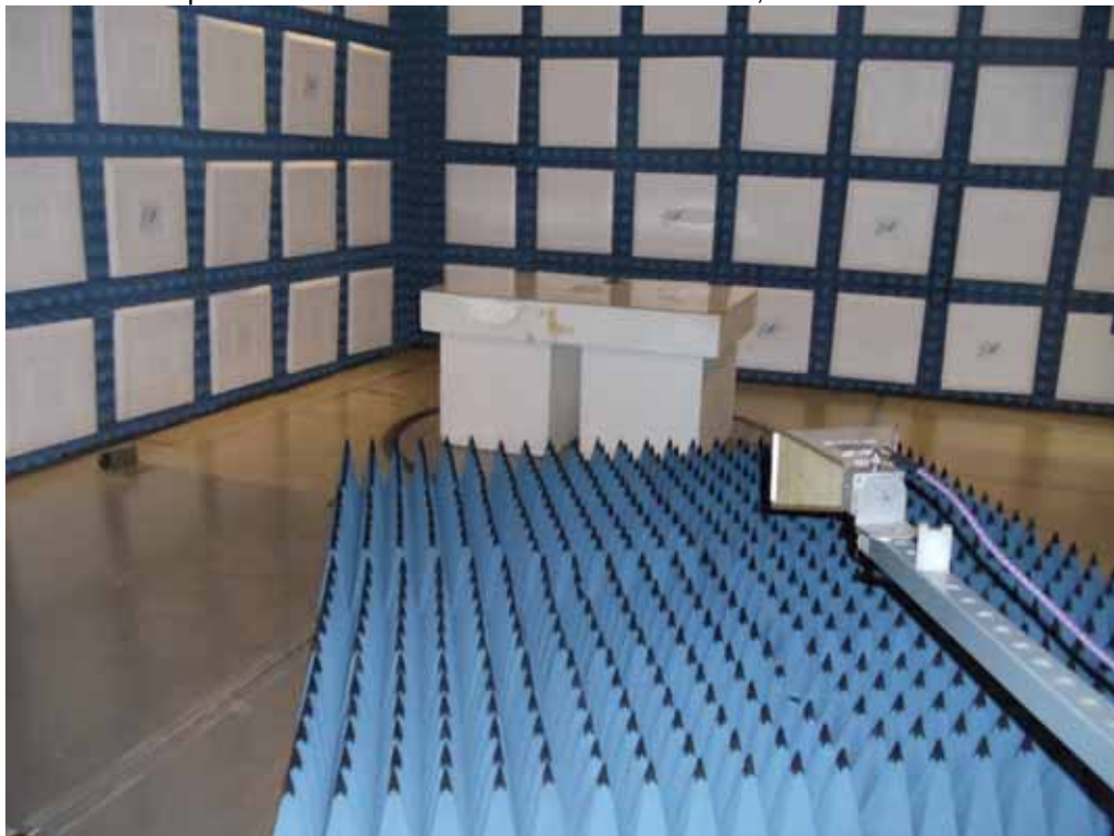
Test Setup for Radiated Emissions – Above 1000MHz, Vertical Polarization