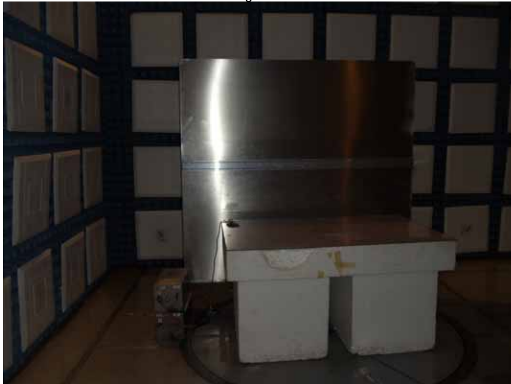
Test Setup for Conducted Emissions