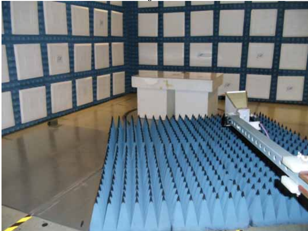
Test Setup for Radiated Emissions – Above 1000MHz, Horizontal Polarization