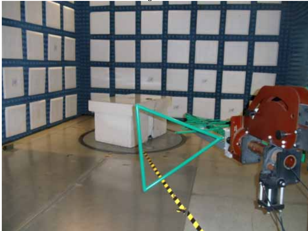
Test Setup for Radiated Emissions – Below 1000MHz, Horizontal Polarization