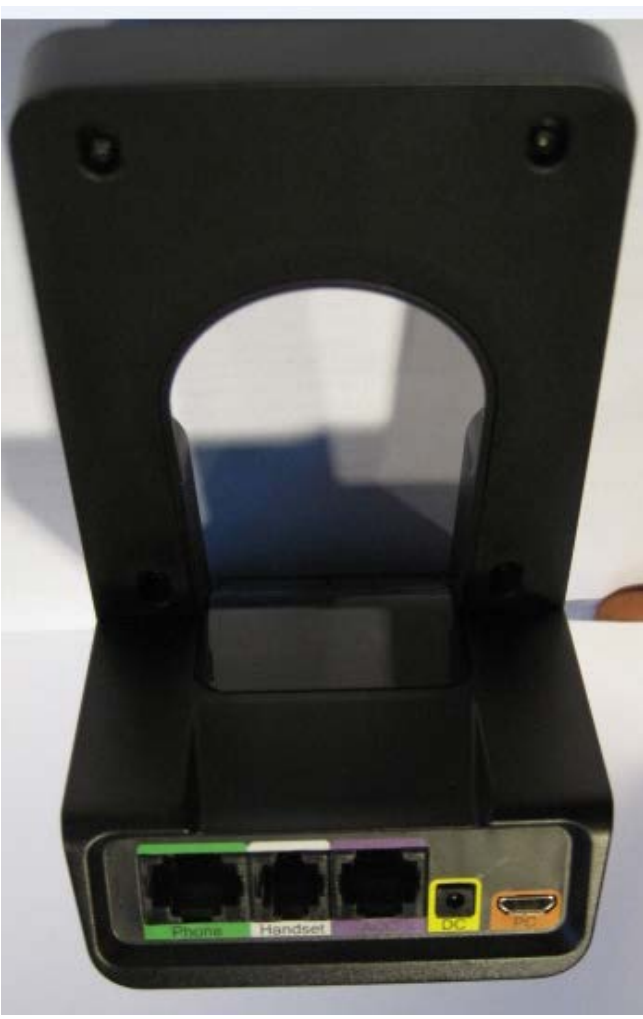
USB and PHONE button