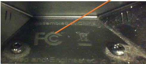
FCC and WEEE logo engraved on BS: