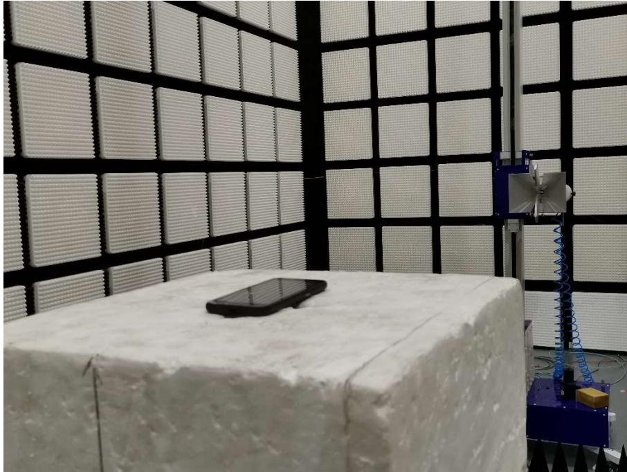
Field Strength of Spurious Radiation (1GHz - 10GHz)