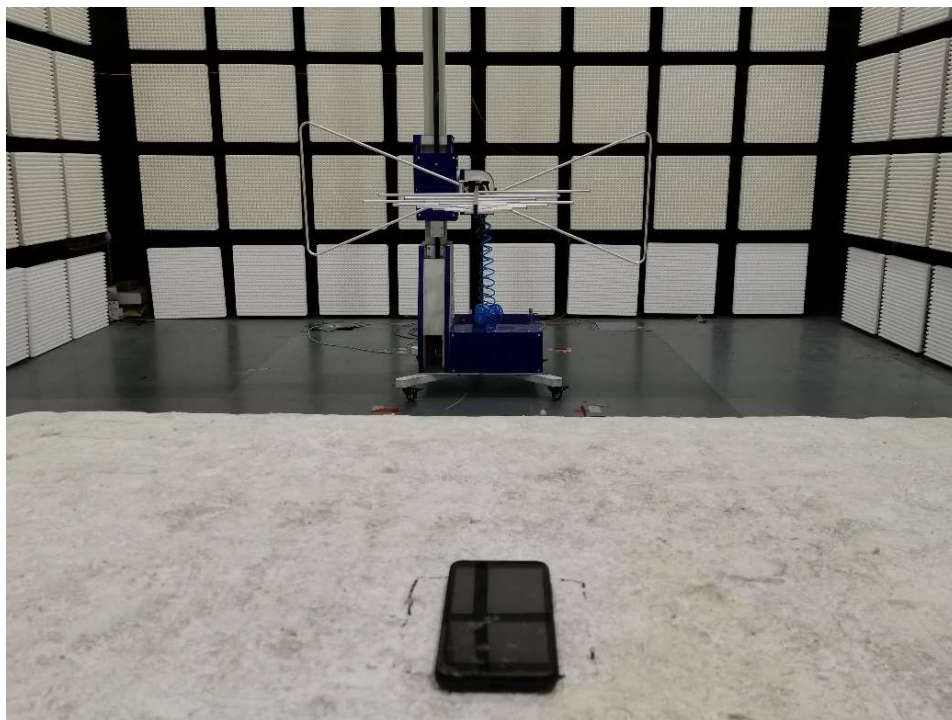
Field Strength of Spurious Radiation (30MHz - 1GHz)