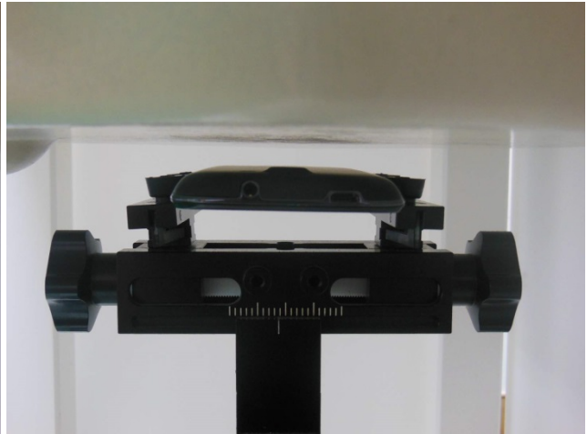
Back of the DUT with Phantom 1 cm Gap