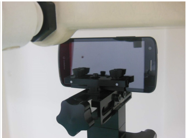
Left Side of the DUT with Phantom 1 cm Gap