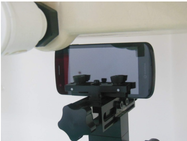
Right Side of the DUT with Phantom 1 cm Gap