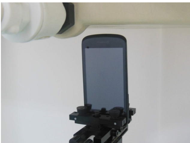
Bottom Side of the DUT with Phantom 1 cm Gap