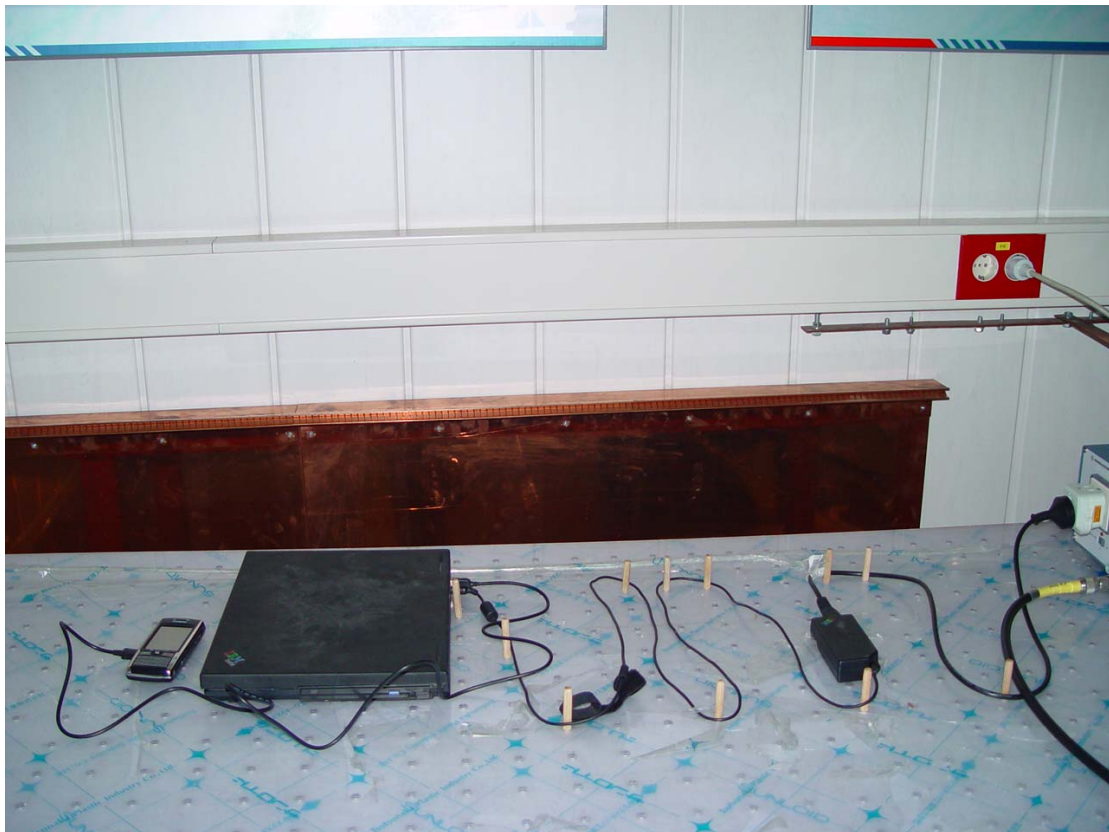
Pic 2 Conducted Emissions Test Setup