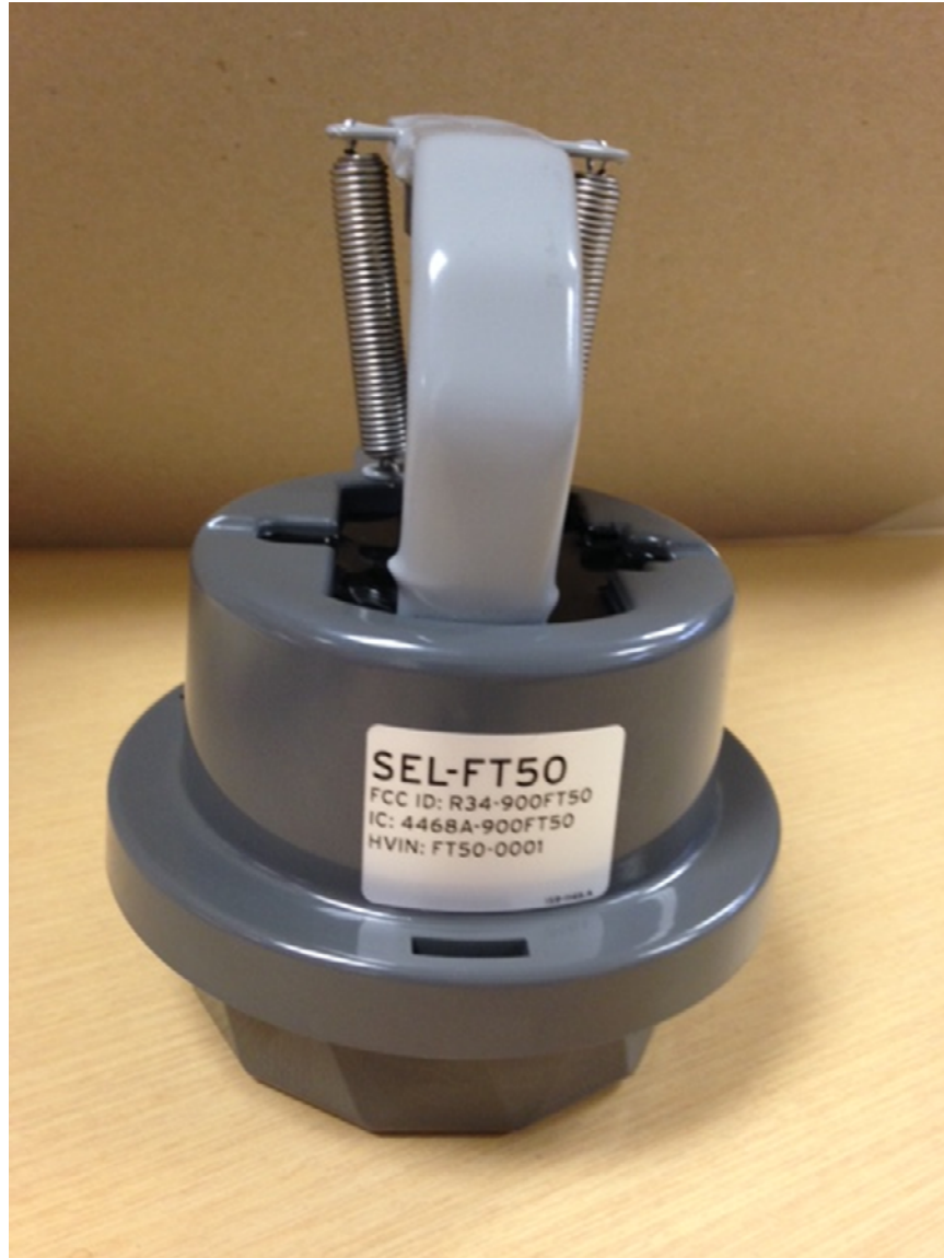
Figure 5: Label on top housing for IC purpose