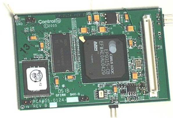
Top View of the Daughter Card