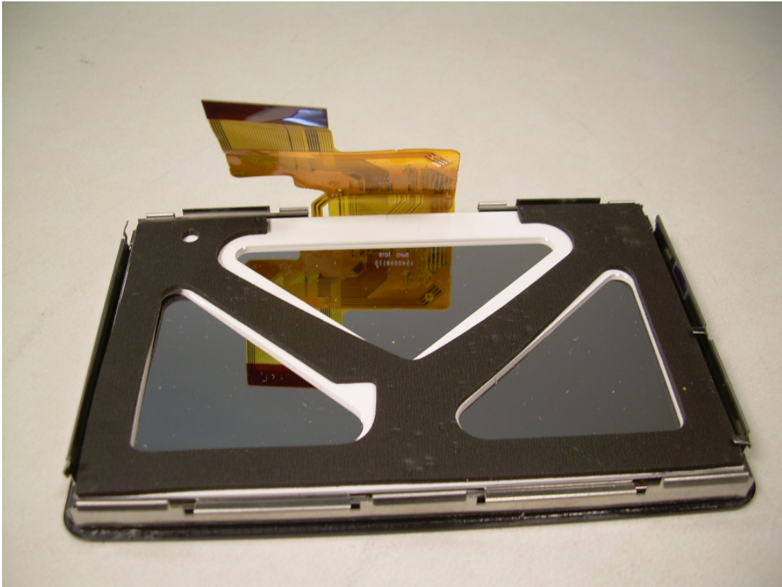
View of the Back of the Touch Screen Assembly