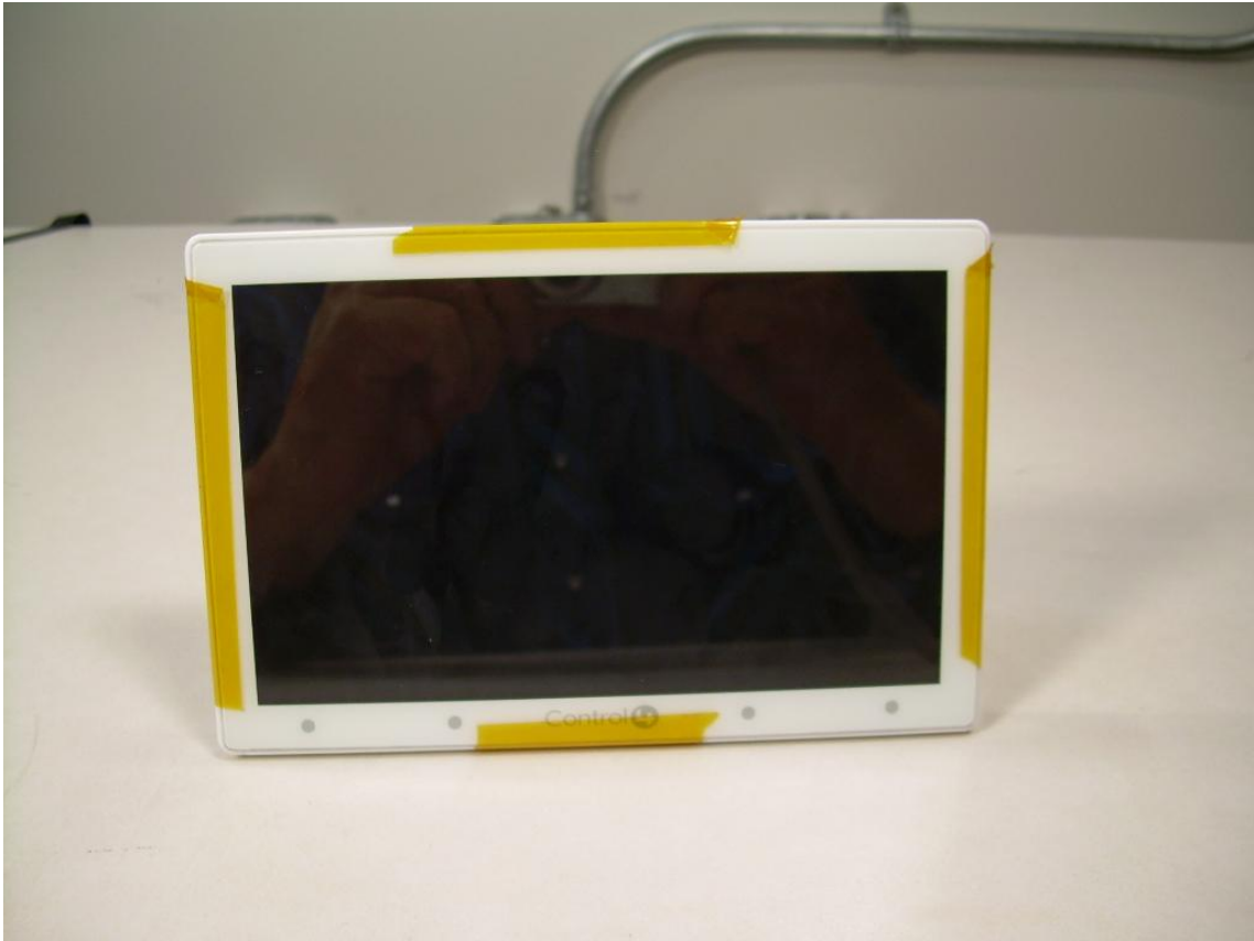
Front View of the EUT