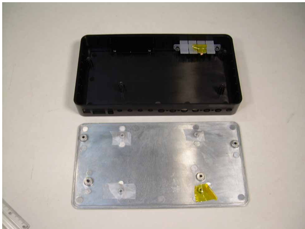
View of the C4-HC200-E-B Housing and Bottom Metal Plate