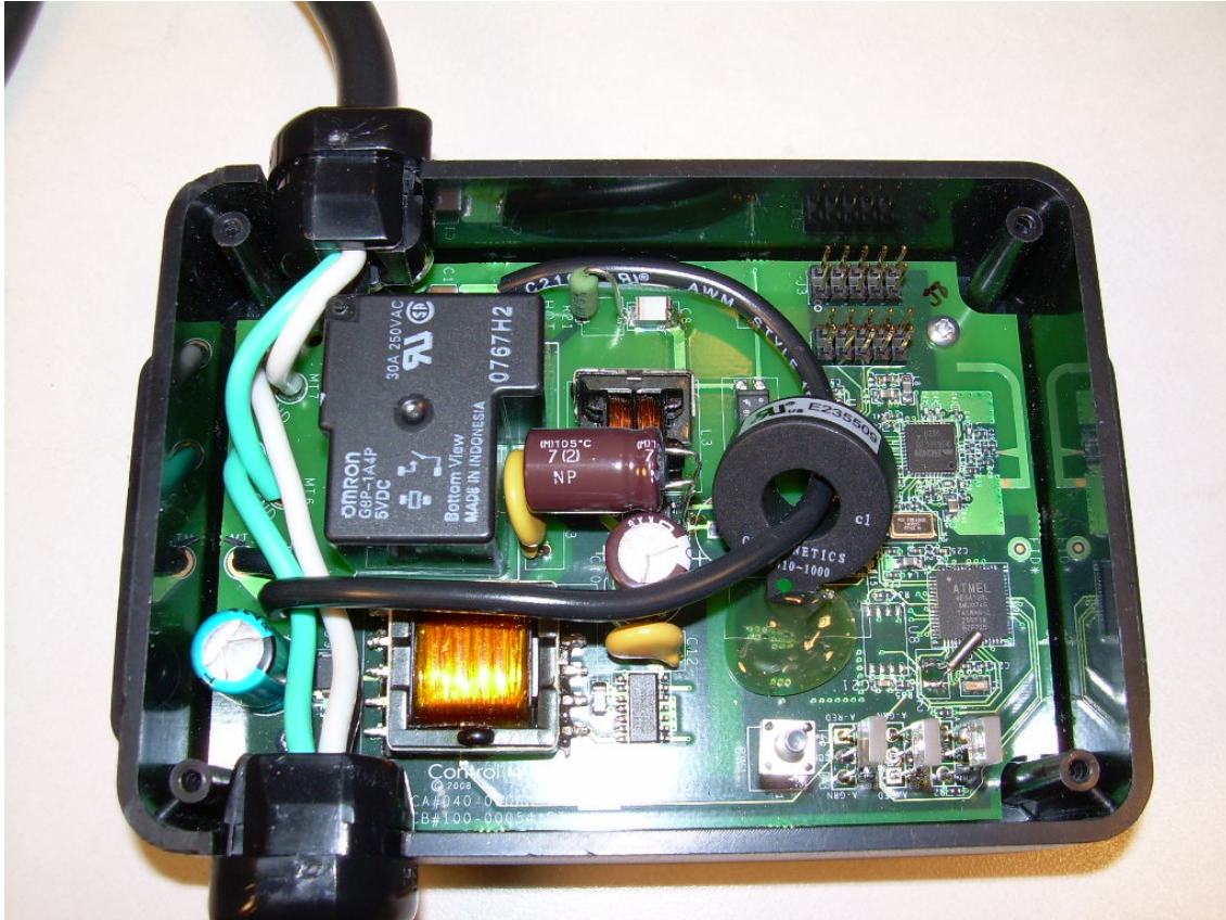
Internal View of the EUT