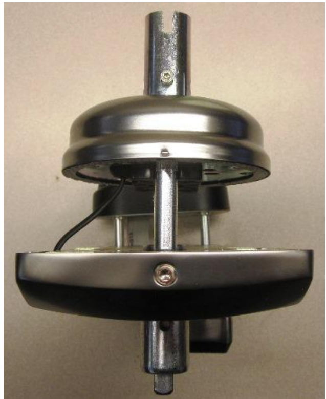
Figure 6. Bottom view of the ADV.