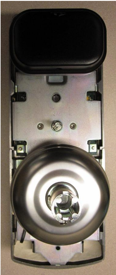
Figure 1. Front view of the ADV.

The following figures (see Fig. 1, Fig. 2, Fig. 3, Fig. 4, Fig. 5, and Fig. 6) depict the assembled electro-mechanical components required to operate an ADVANCE RFID BTLE lock (ADV).