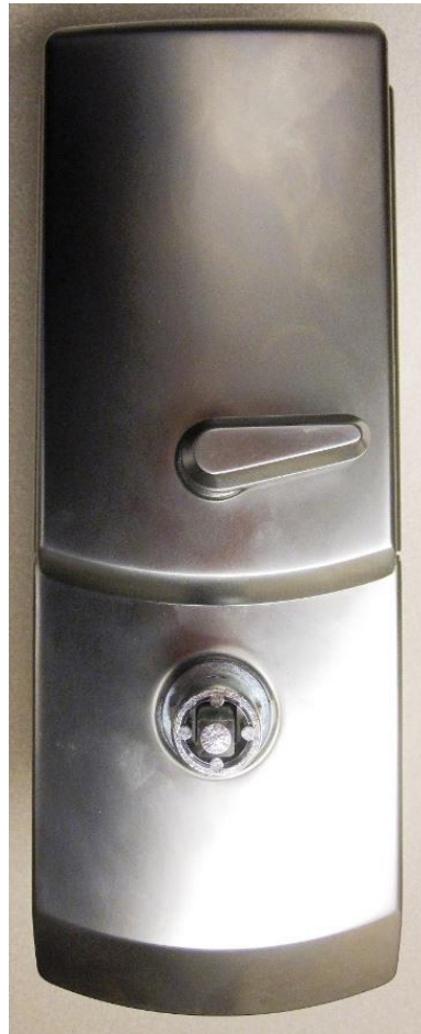
Figure 2. Back view of the ADV.