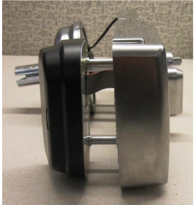
Figure 5. Top view of the ADV.