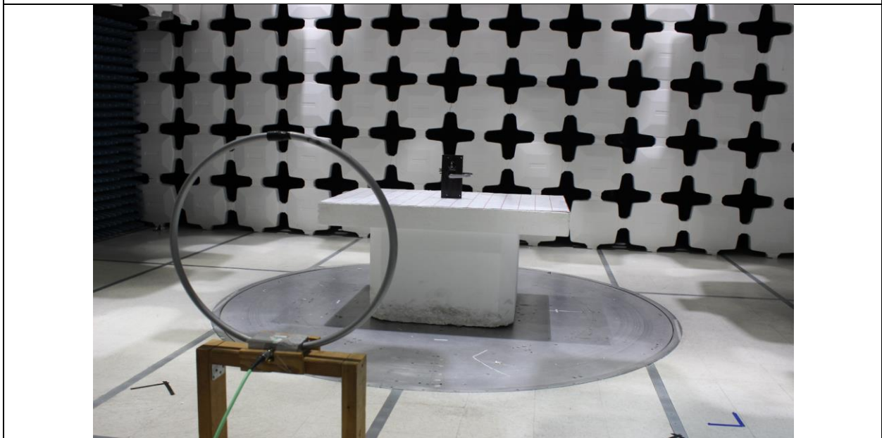
Radiated Emission Test Below 30MHz Rear View