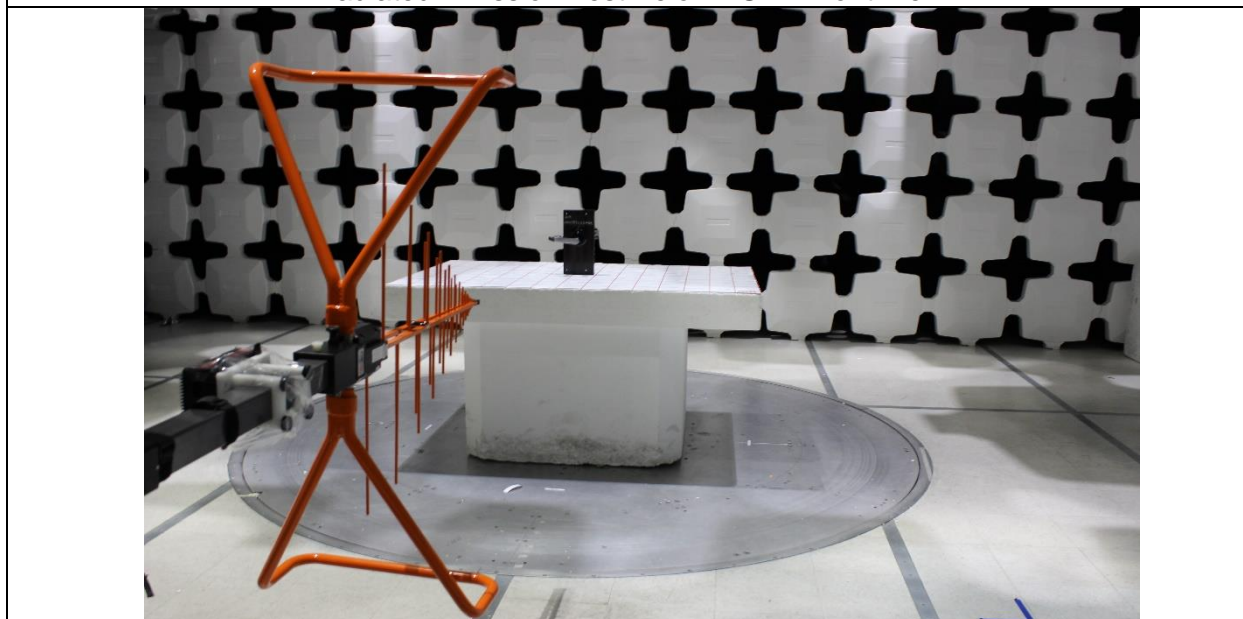
Radiated Emission Test Below 1GHz Rear View