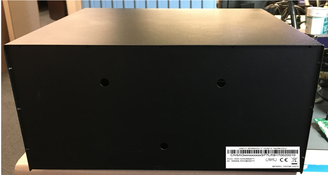
Figure 1. Location of labeling on the back side of the OS700 Safe.

This example approximates the placement of RF regulatory labeling on the OS700 Safe (see Fig. 1).