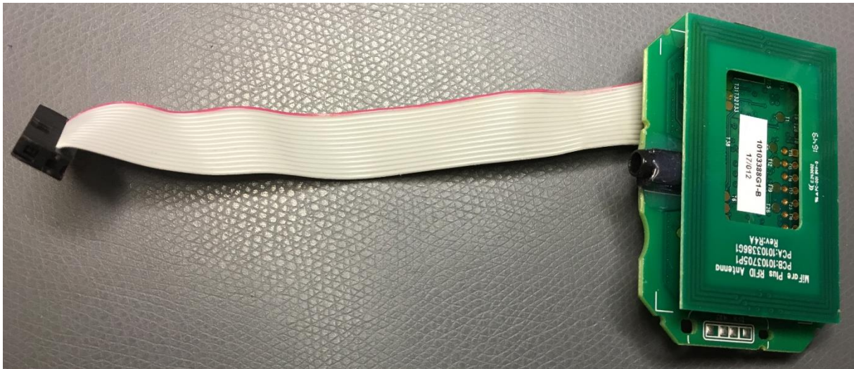
Figure 2. RFID Reader electrical assembly (with antenna), with standard RFID card