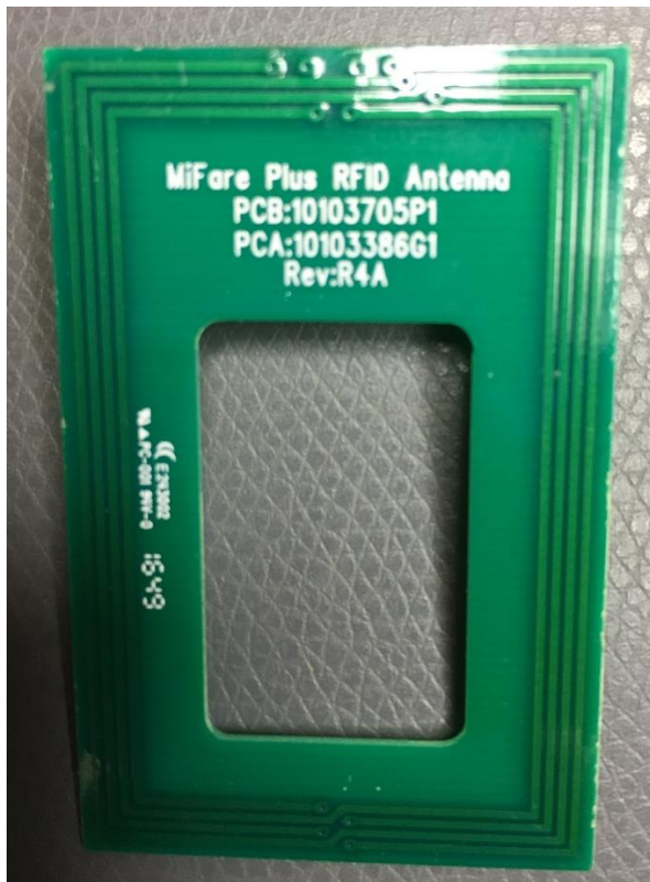
Figure 1. Left – Image of Antenna

The antenna consists of 4 interwoven loops of copper trace along the edges of the top layer of a 0.032" thick PCB. The trace length sums to a full length of 24.3 inches (61.7cm). The outer dimensions of the antenna traces are 2.025 inches by 1.285 inches (5.14cm by 3.26cm). A hole through the center of the PCB allows for potting ingress and does not affect the functionality of the antenna.