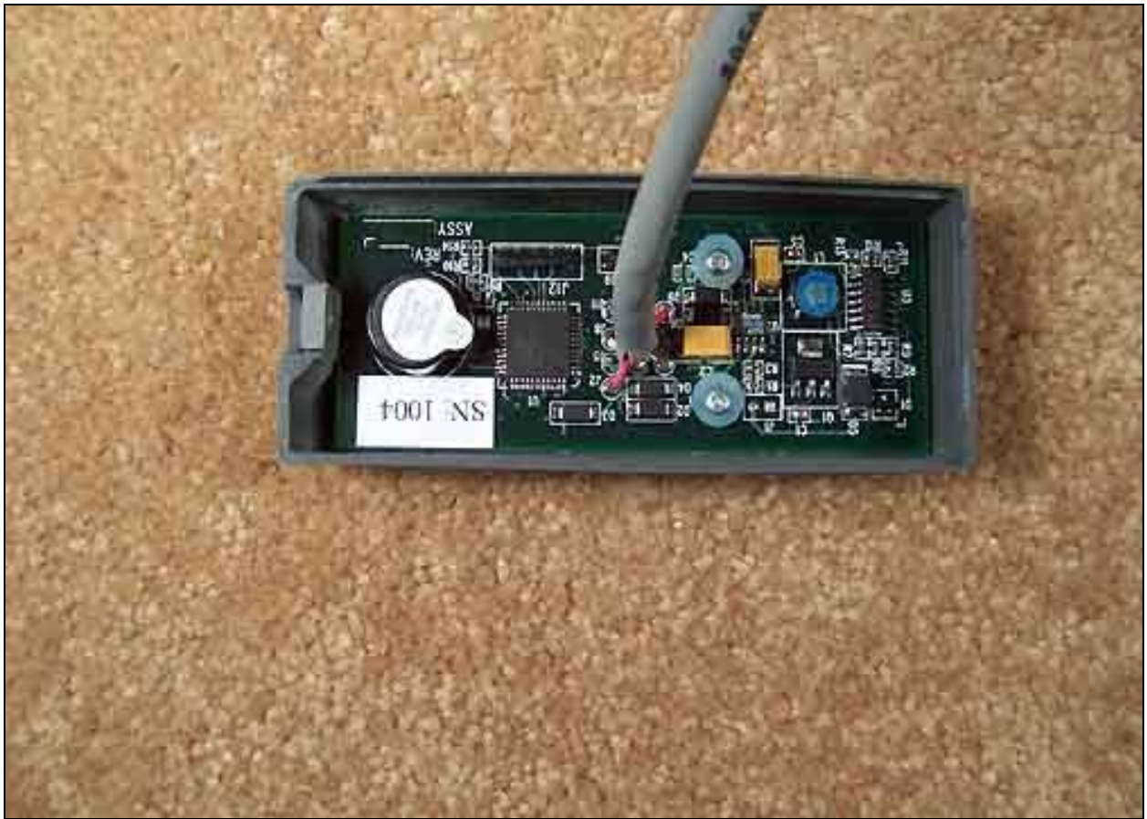
Interior Overall Unpotted