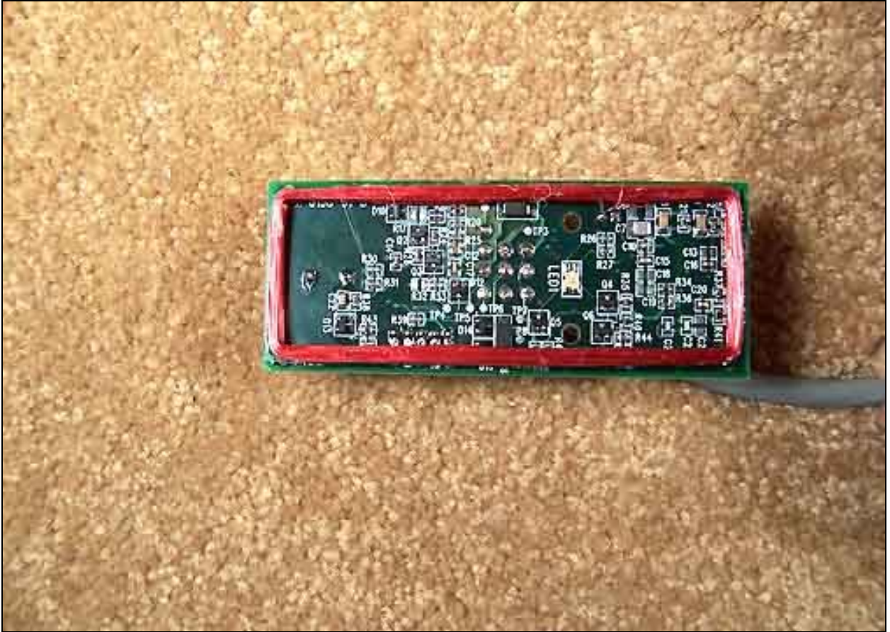
PCB Bottom - Antenna in Place