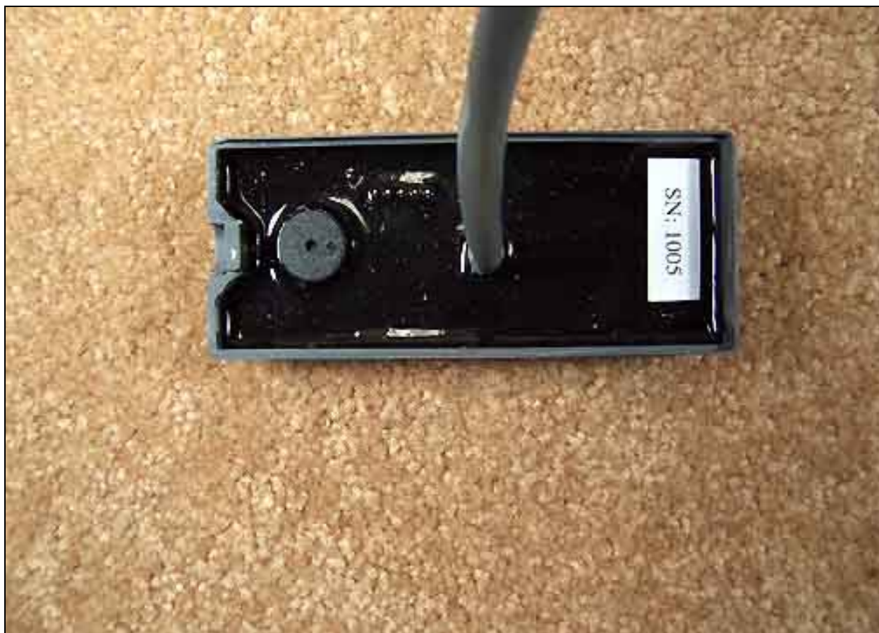
Exterior Back Cover Removed