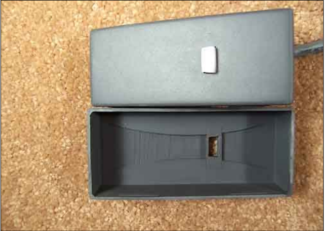
Exterior Front Cover Removed