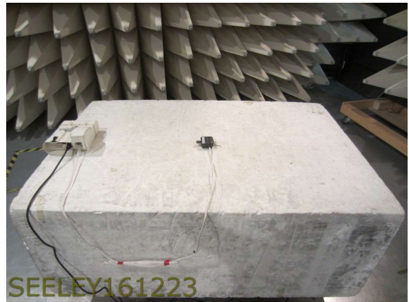
Radiated Emissions Below 1GHz - Wireless Receiver

This document shall not be reproduced, except in full