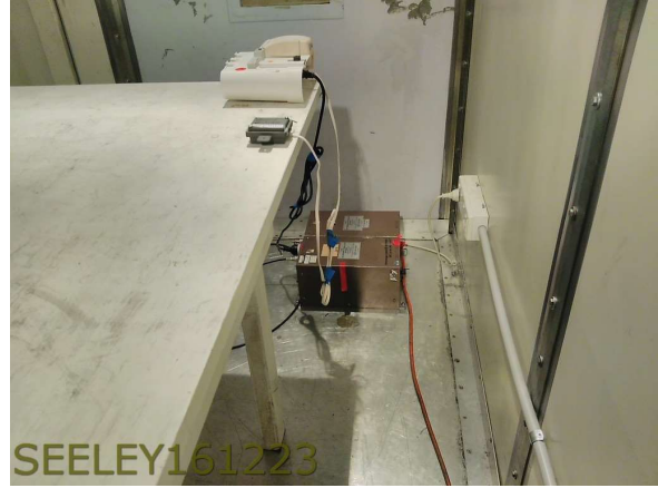
Mains Conducted Emissions -Wireless Receiver

This document shall not be reproduced, except in full