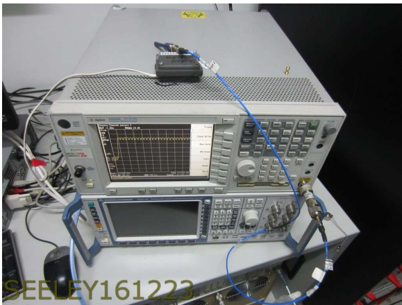
Frequency Hopping Tests – Wireless Receiver

This document shall not be reproduced, except in full