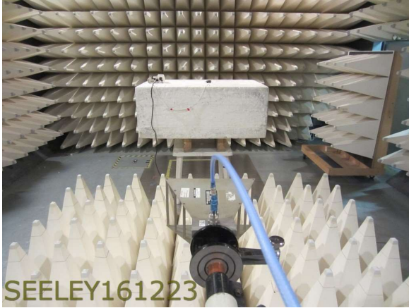
Radiated Emissions Above 1GHz – Wireless Receiver