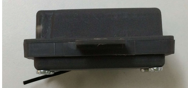
Wireless Receiver (Top)