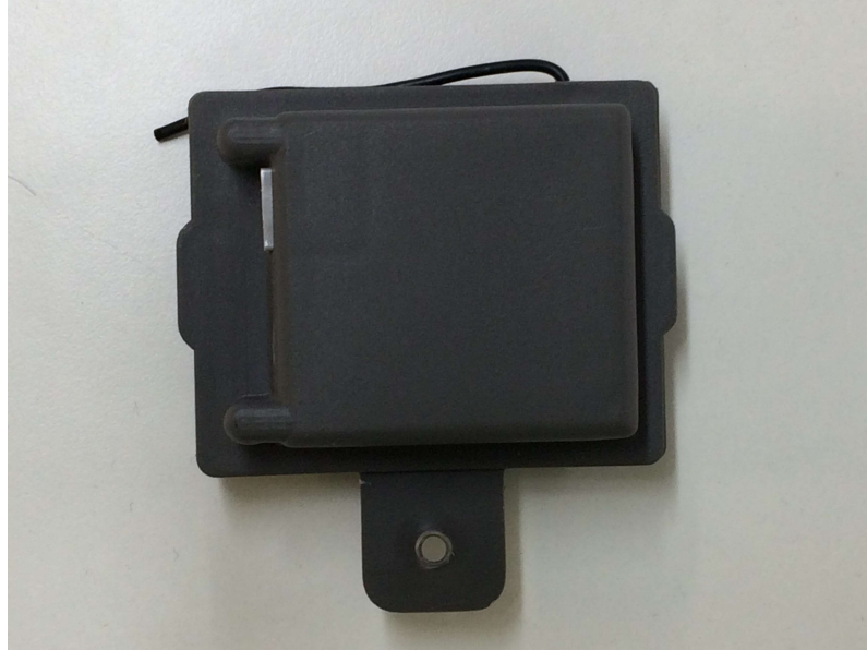
Wireless Receiver (Front)