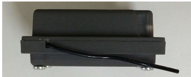
Wireless Receiver (Bottom)