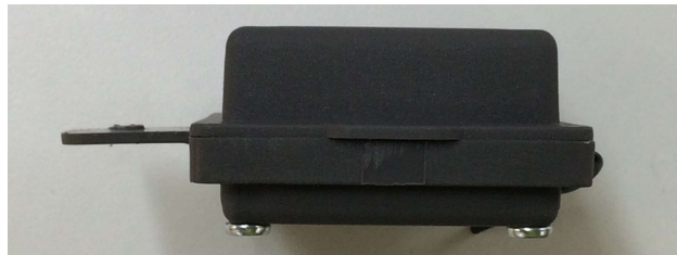
Wireless Receiver (Left Hand Side)