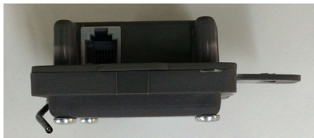
Wireless Receiver (Right Hand Side)

This document shall not be reproduced, except in full