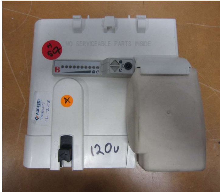
Cooler Controller (for Wireless Receiver)