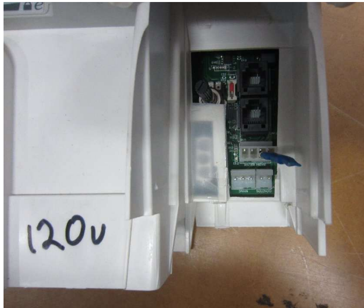
Cooler Controller Connection (for Wireless Receiver)

This document shall not be reproduced, except in full