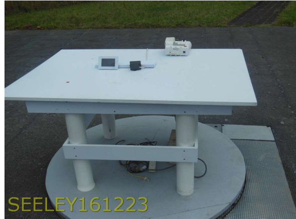
Radiated Emissions Below 30MHz –Wireless Smart Controller & Supporting Wireless Receiver