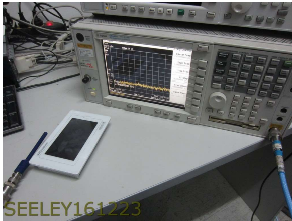
Frequency Hopping Tests – Wireless Smart Controller

This document shall not be reproduced, except in full