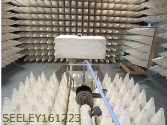
Radiated Emissions Above 1GHz – Wireless Smart Controller