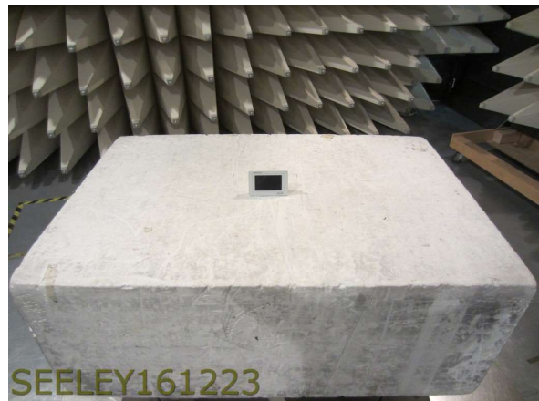
Radiated Emissions Below 1GHz – Wireless Smart Controller

This document shall not be reproduced, except in full