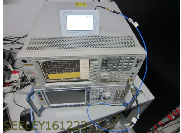
Antenna Port Tests – Wireless Smart Controller