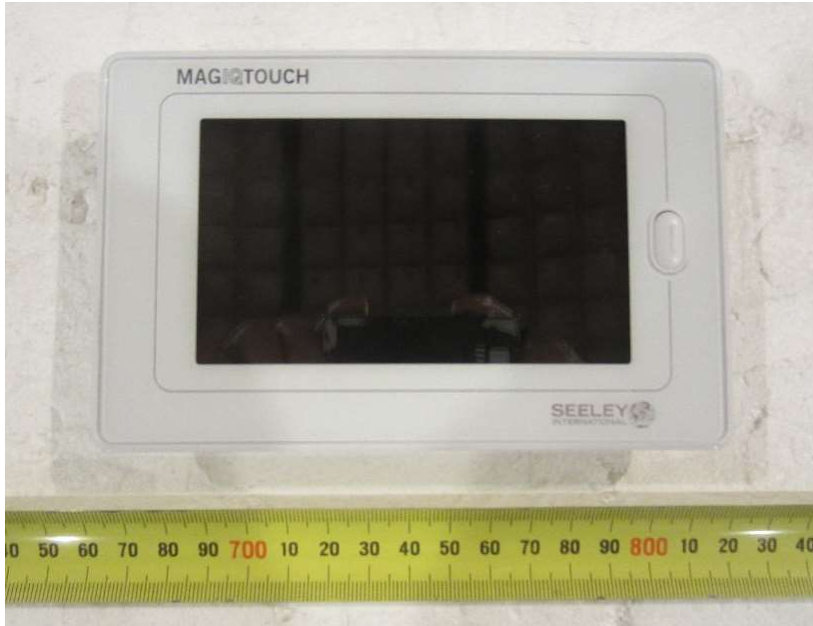
Wall Controller (Front)