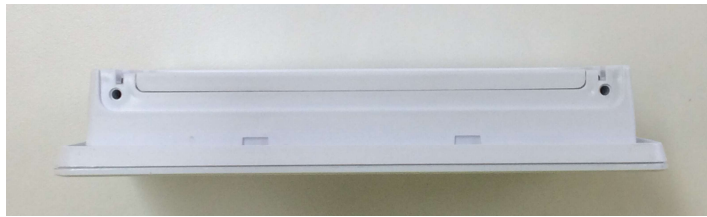
Wall Controller (Bottom)