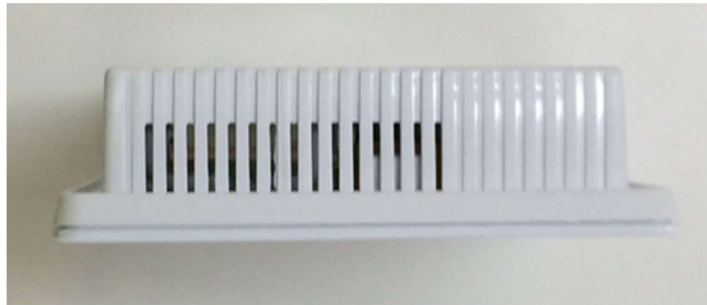
Wall Controller (Left Hand Side)