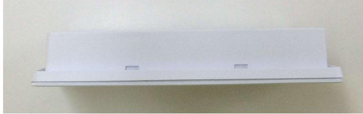
Wall Controller (Top)