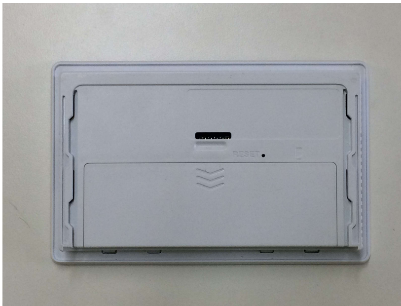
Wall Controller (Back)

This document shall not be reproduced, except in full