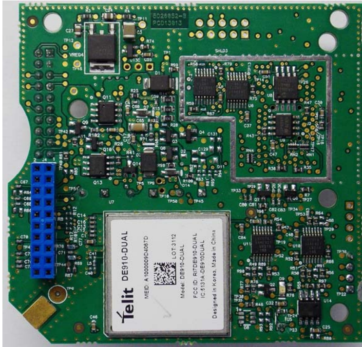
Figure 3 - WWIC3G EV-DO PCBA (BOTTOM)