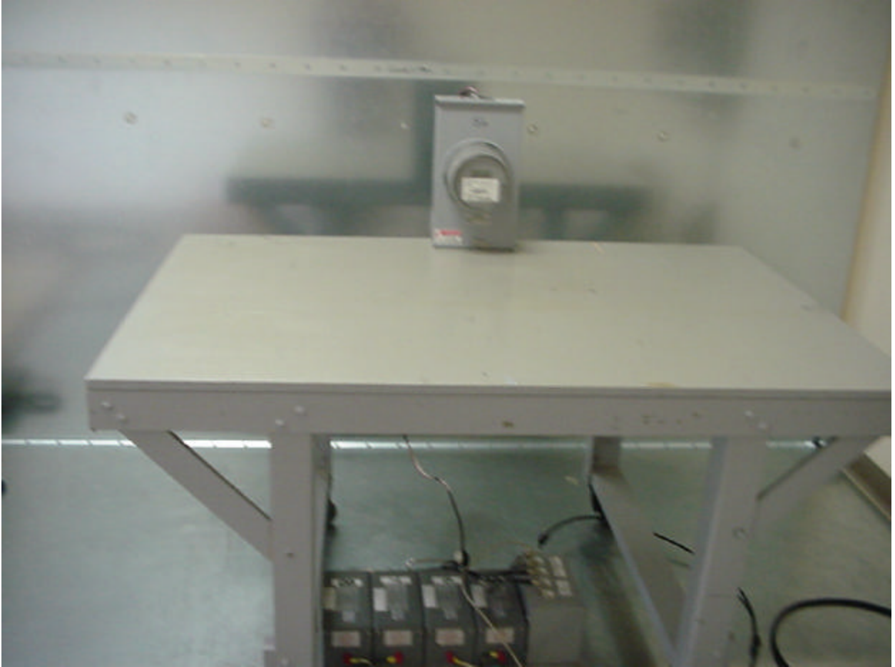
Figure 3 - Conducted Emissions Test Setup (Front)