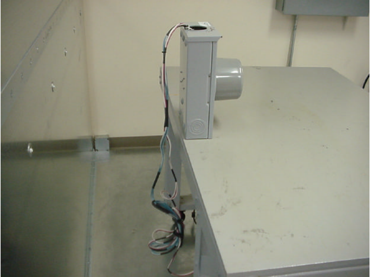
Figure 4 - Conducted Emissions Test Setup (Back)