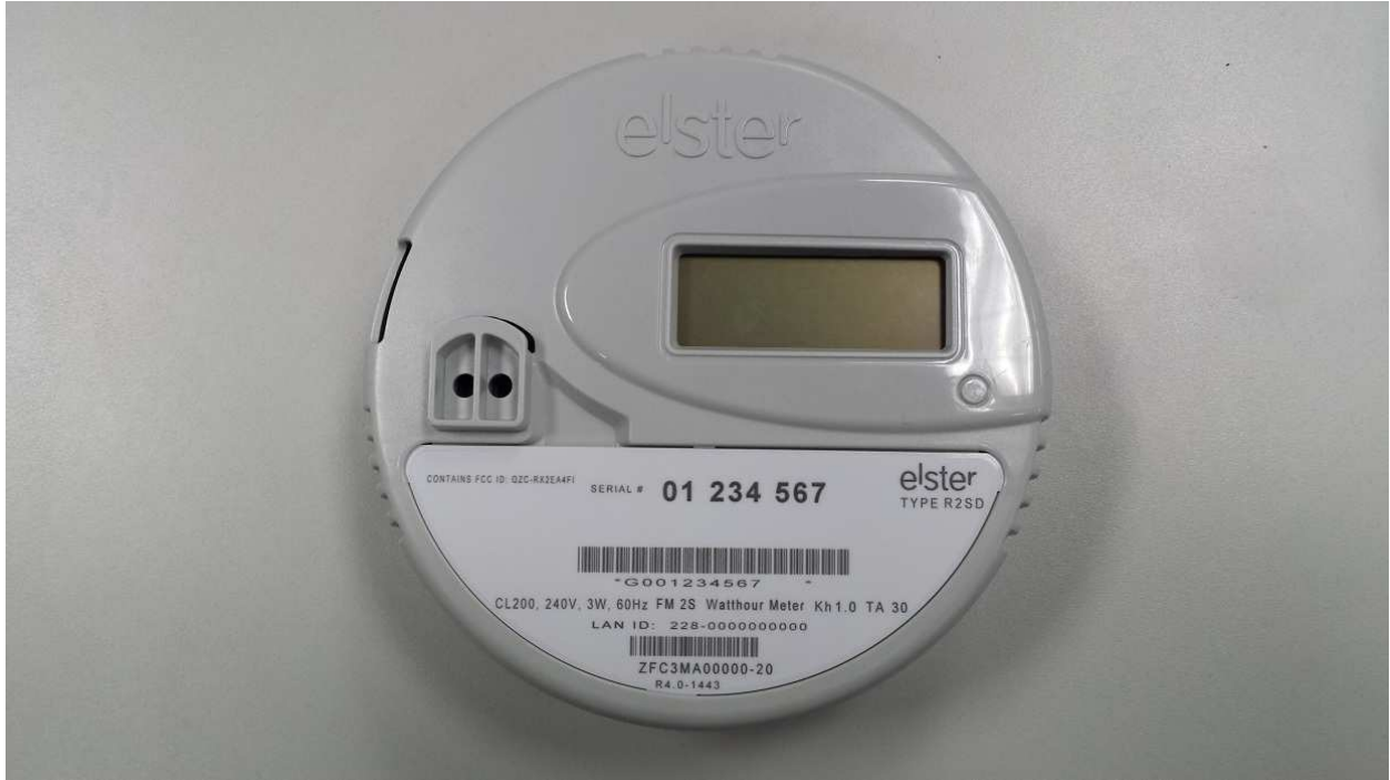
Figure 3: Sample Host Label