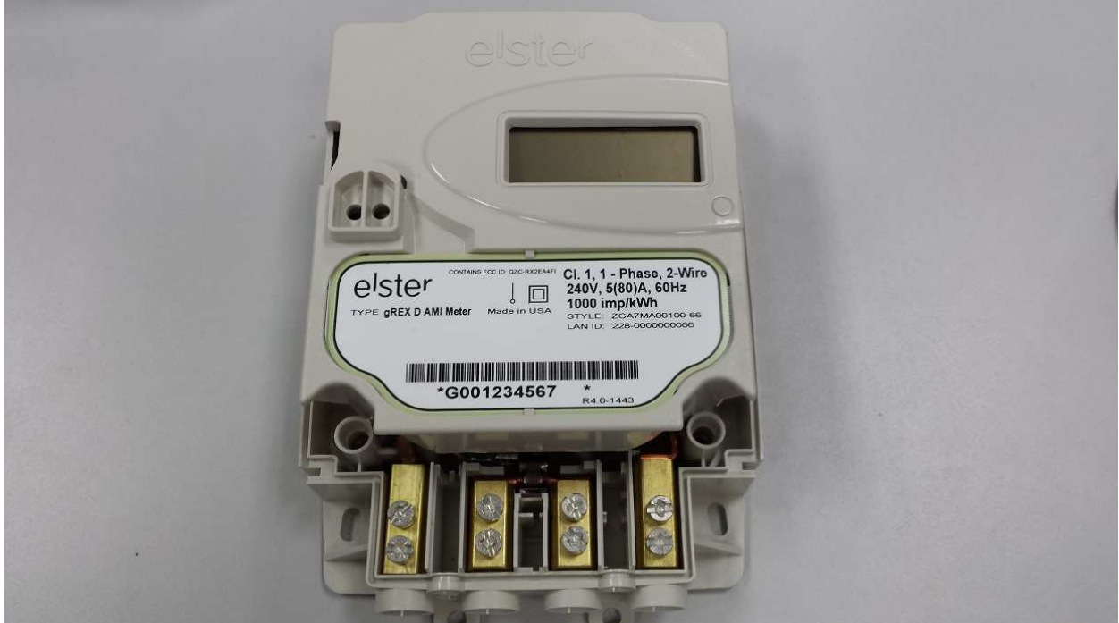
Figure 4: Sample Host Label (gREX)