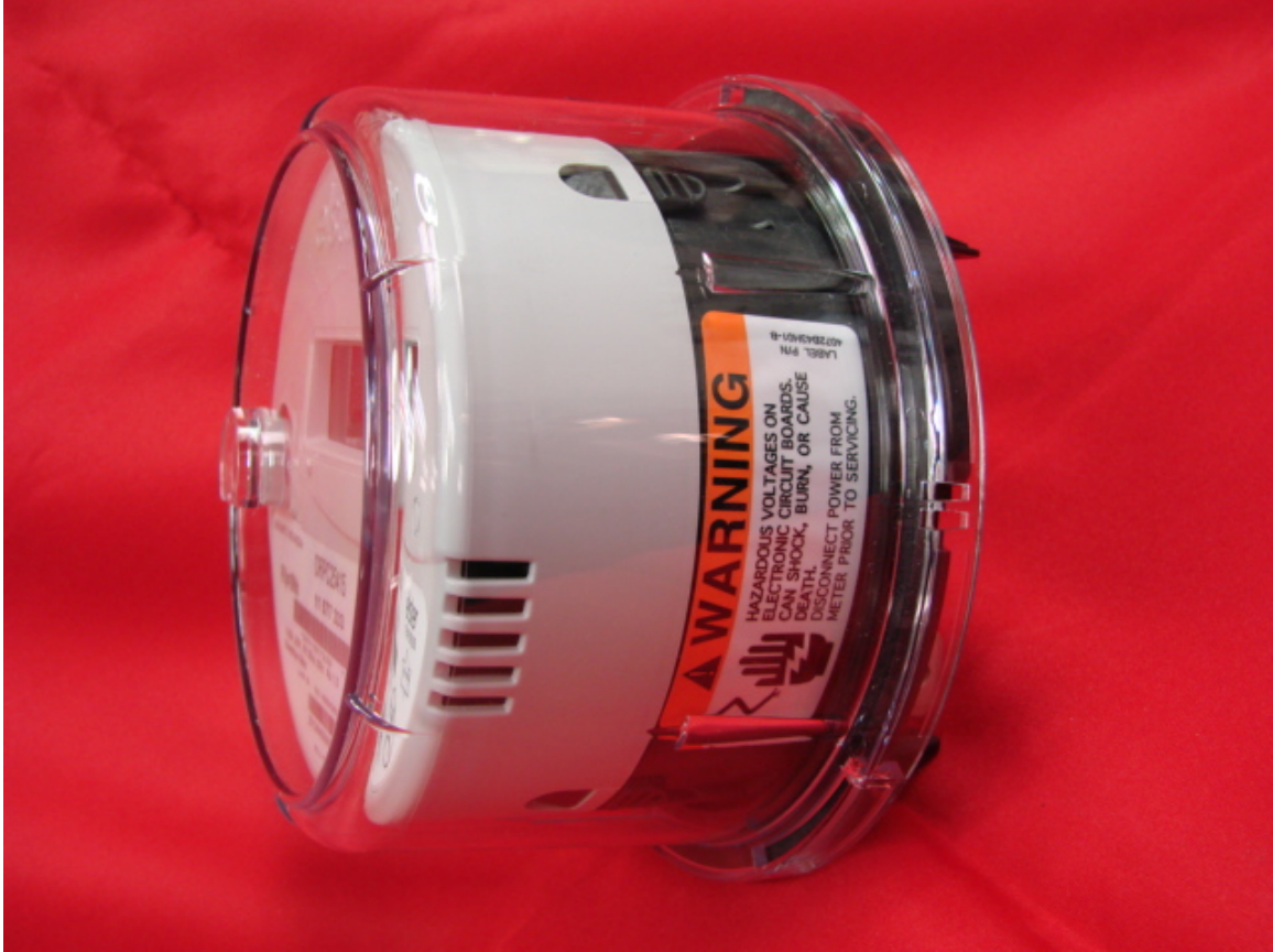
Figure 2: Right Side View