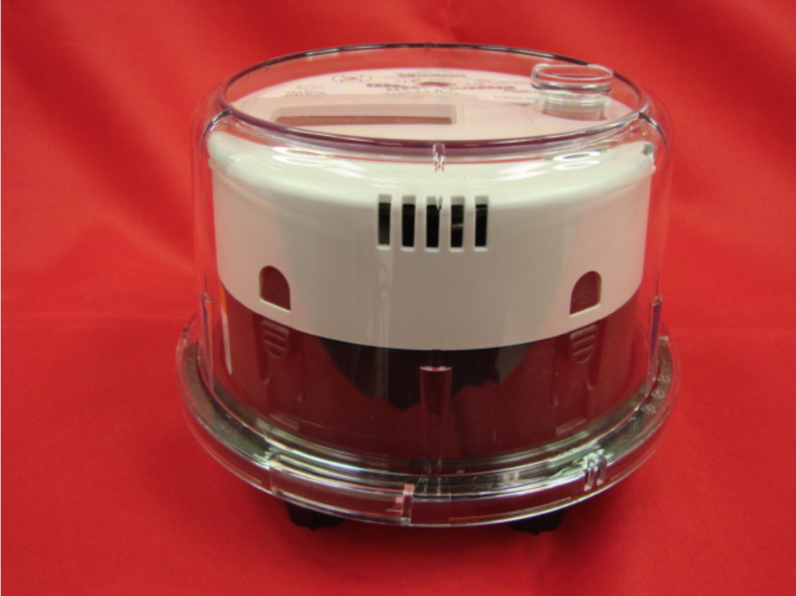
Figure 5: Top View