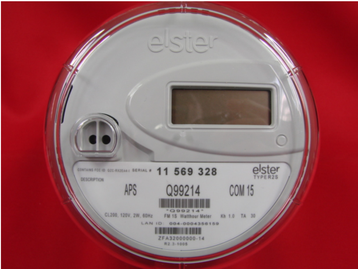
Figure 1: Front View

Figure 1 shows the front view of a Rex2 meter containing the RX2EA4-I module. A compliance statement at the upper left of the nameplate states, “Contains FCC ID: QZC-RX2EA4-I.”