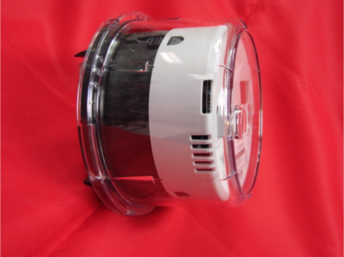
Figure 3: Left Side View