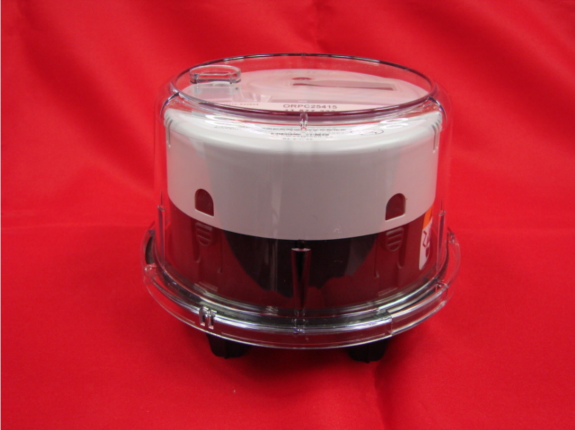
Figure 4: Bottom view