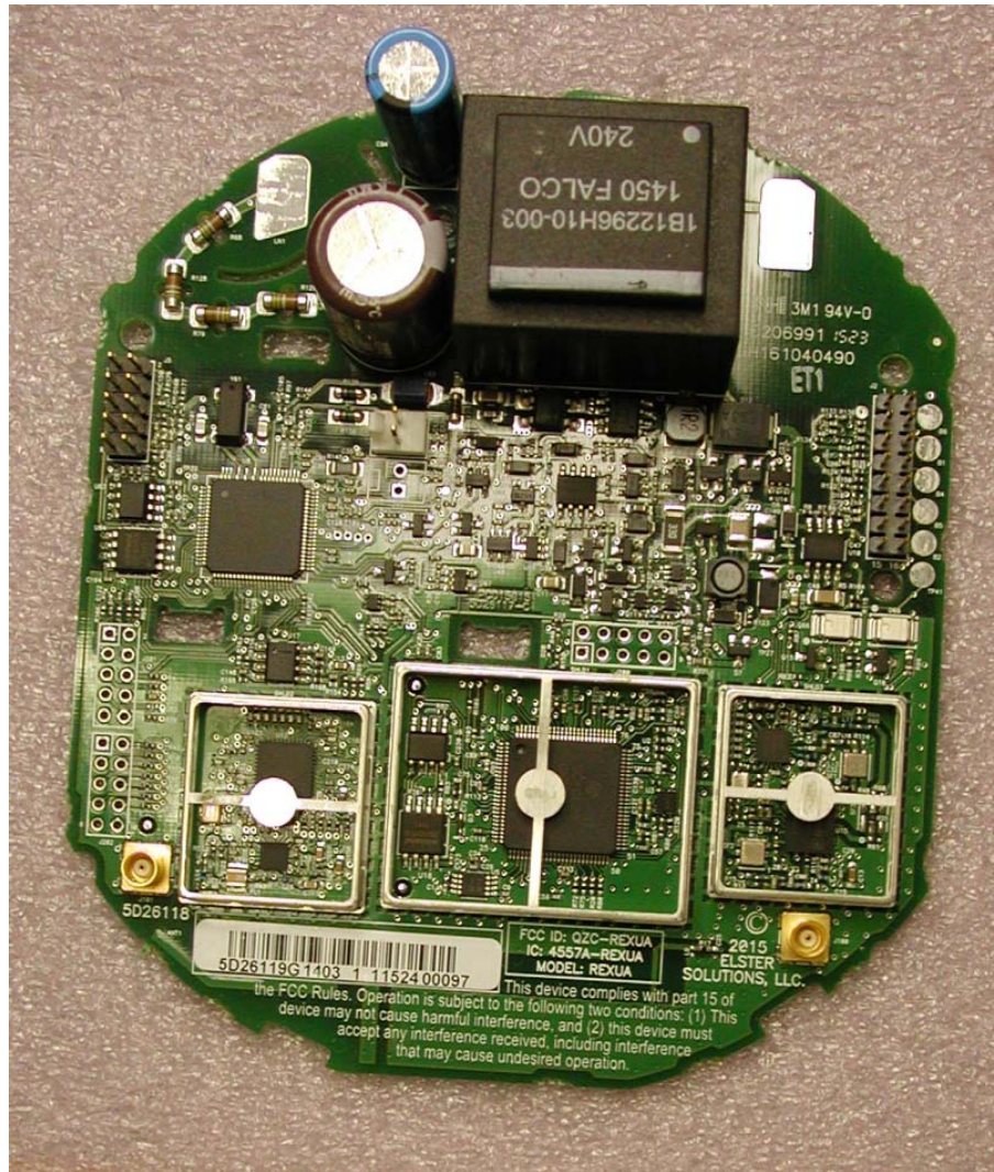
Figure 3: REXUA with shield lids removed