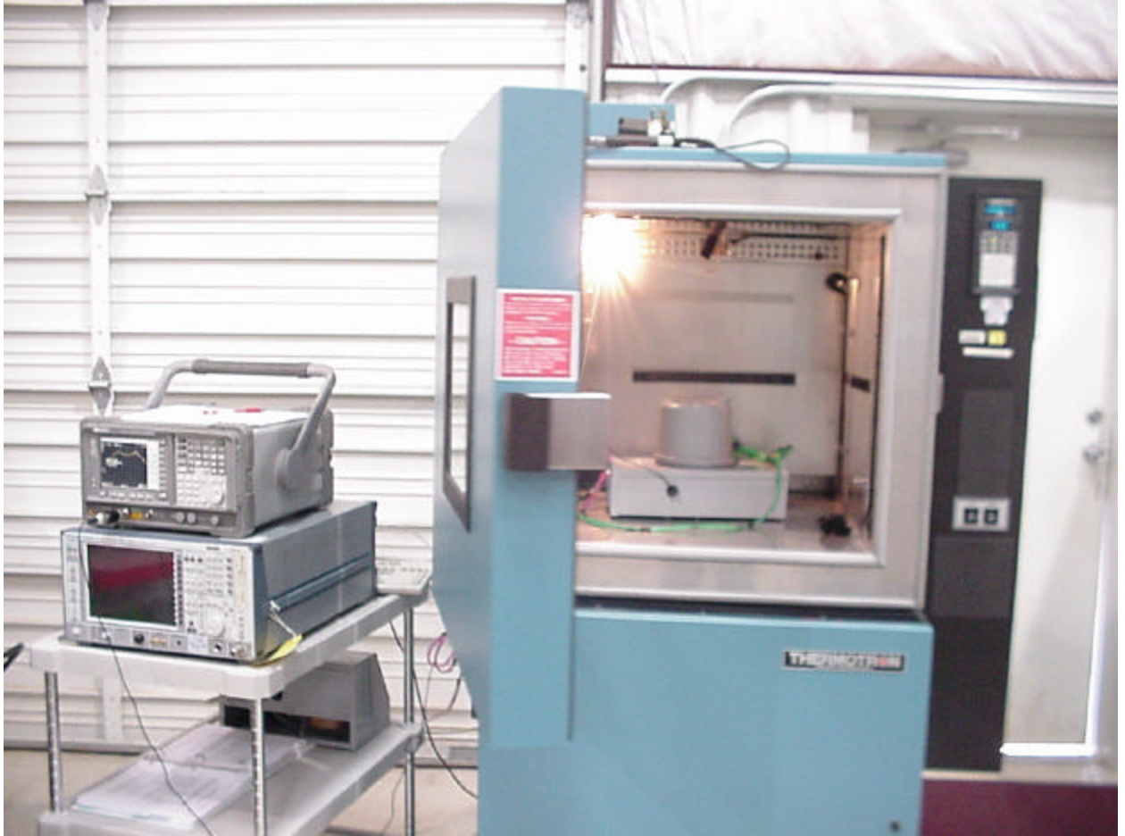
Figure 3 – Temperature Chamber Setup