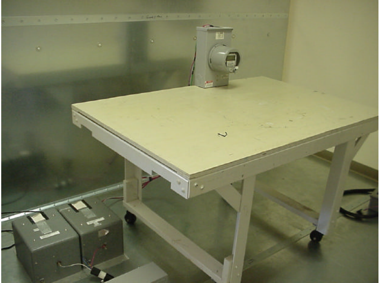
Figure 6 - Conducted Emissions Test Setup (Front)