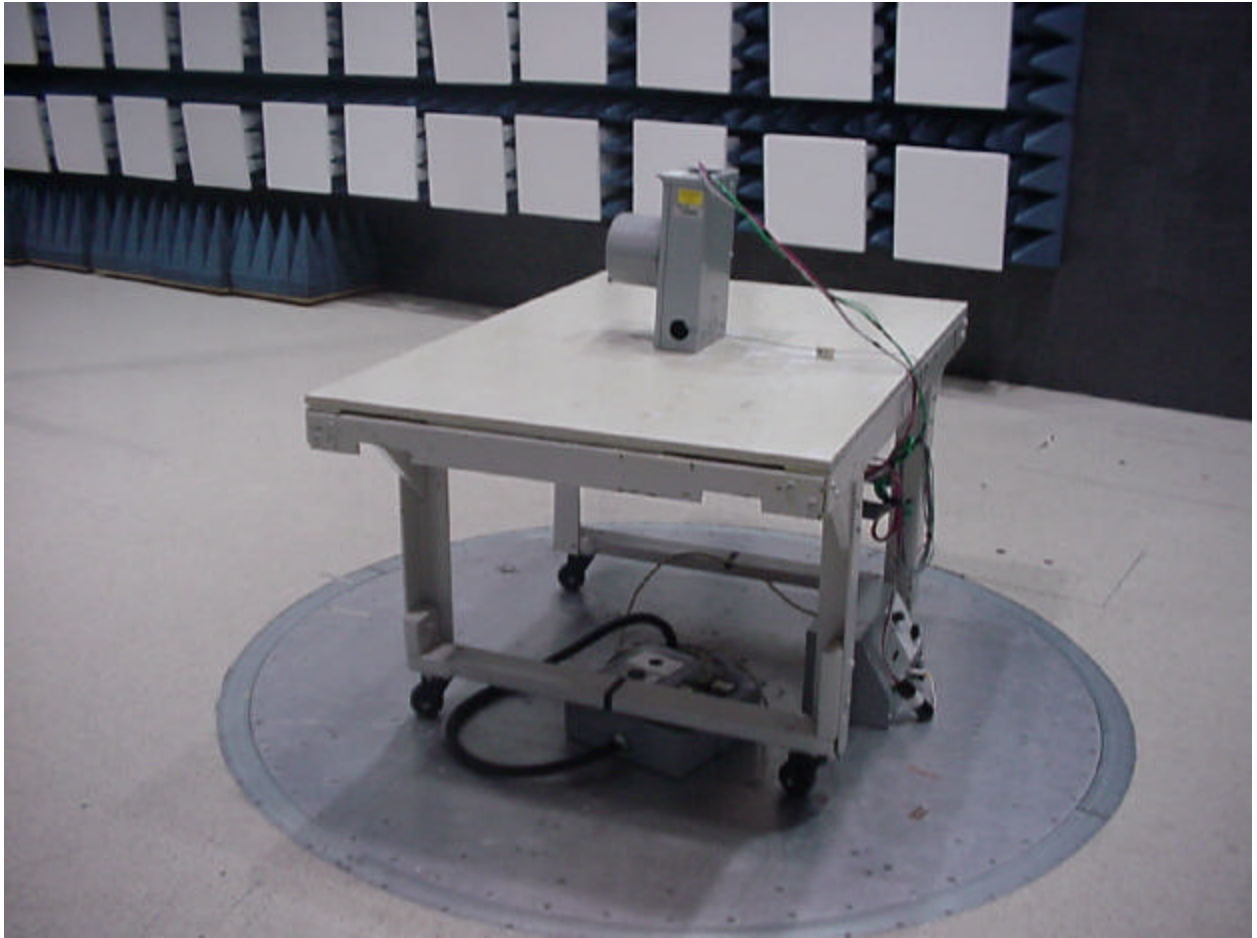
Figure 2 - Radiated Emissions Test Setup (Chamber – Back, X orientation)