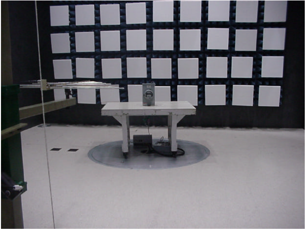
Figure 1 - Radiated Emissions Test Setup (Chamber – Front, X orientation)