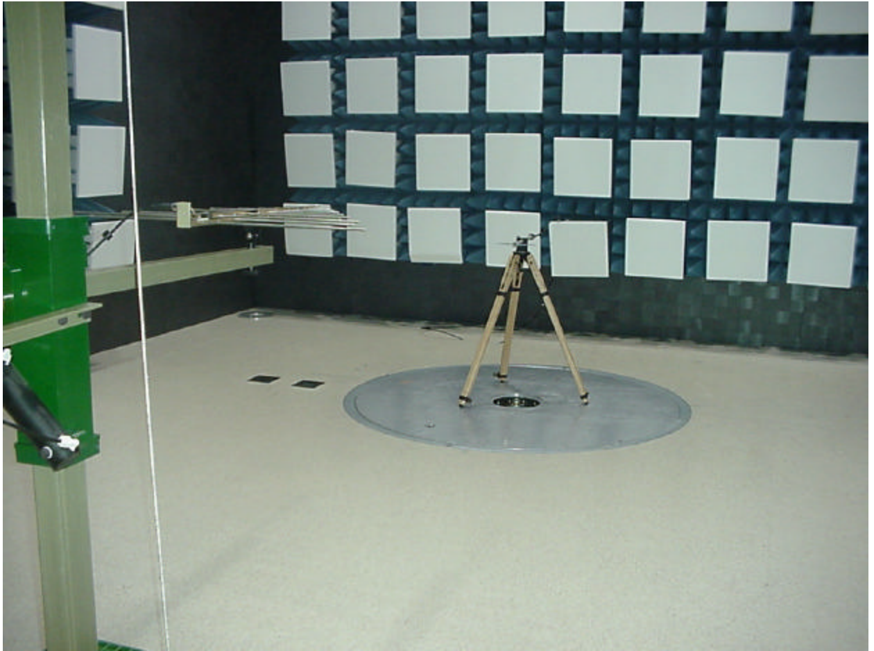
Figure 4 – Setup for Substitution Method