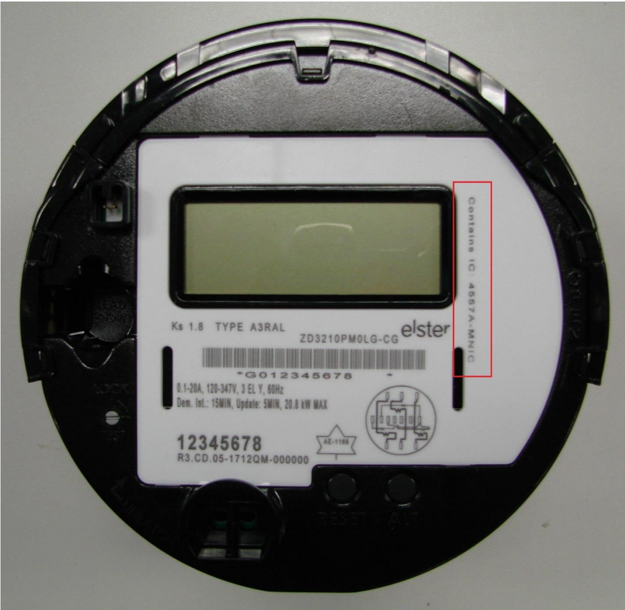
A3 electricity meter front view, showing IC: 4557A-MNIC