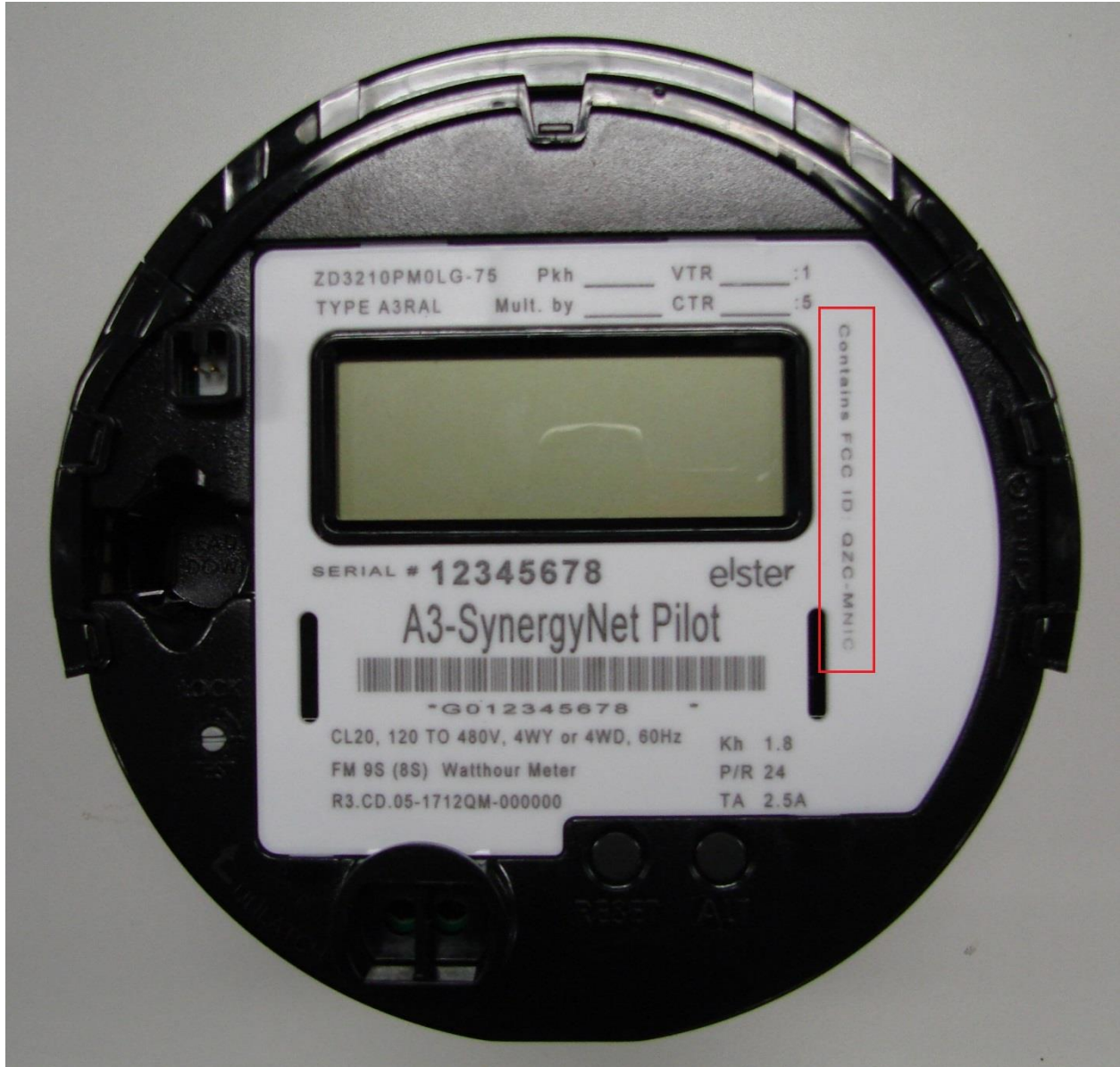
A3 electricity meter front view, showing FCC ID: QZC-MNIC

Photographs of A3 meter nameplates showing regulatory identification number FCC ID: QZC-MNIC, FCC ID: QZC-MNIC1, and IC: 4557A-MNIC