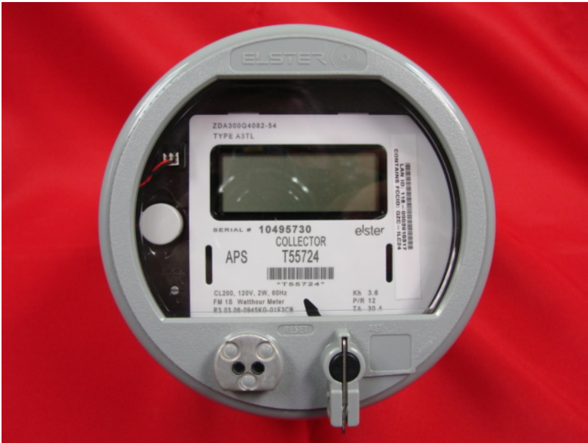
Figure 1: Front View ILC24

Figure 1 shows the front view of an A3 meter containing the ILC24 module. The vertically orientated compliance label on the right side of the meter display states, "Contains FCC ID: QZC-ILC24."