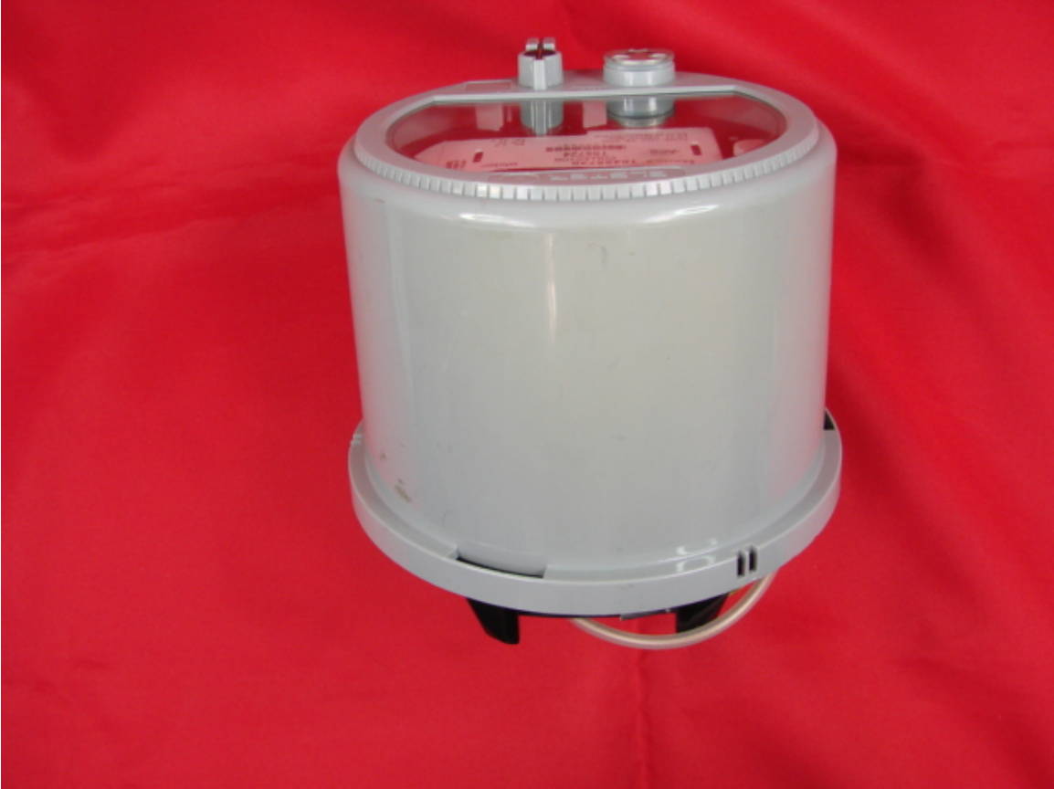
Figure 5: Top View