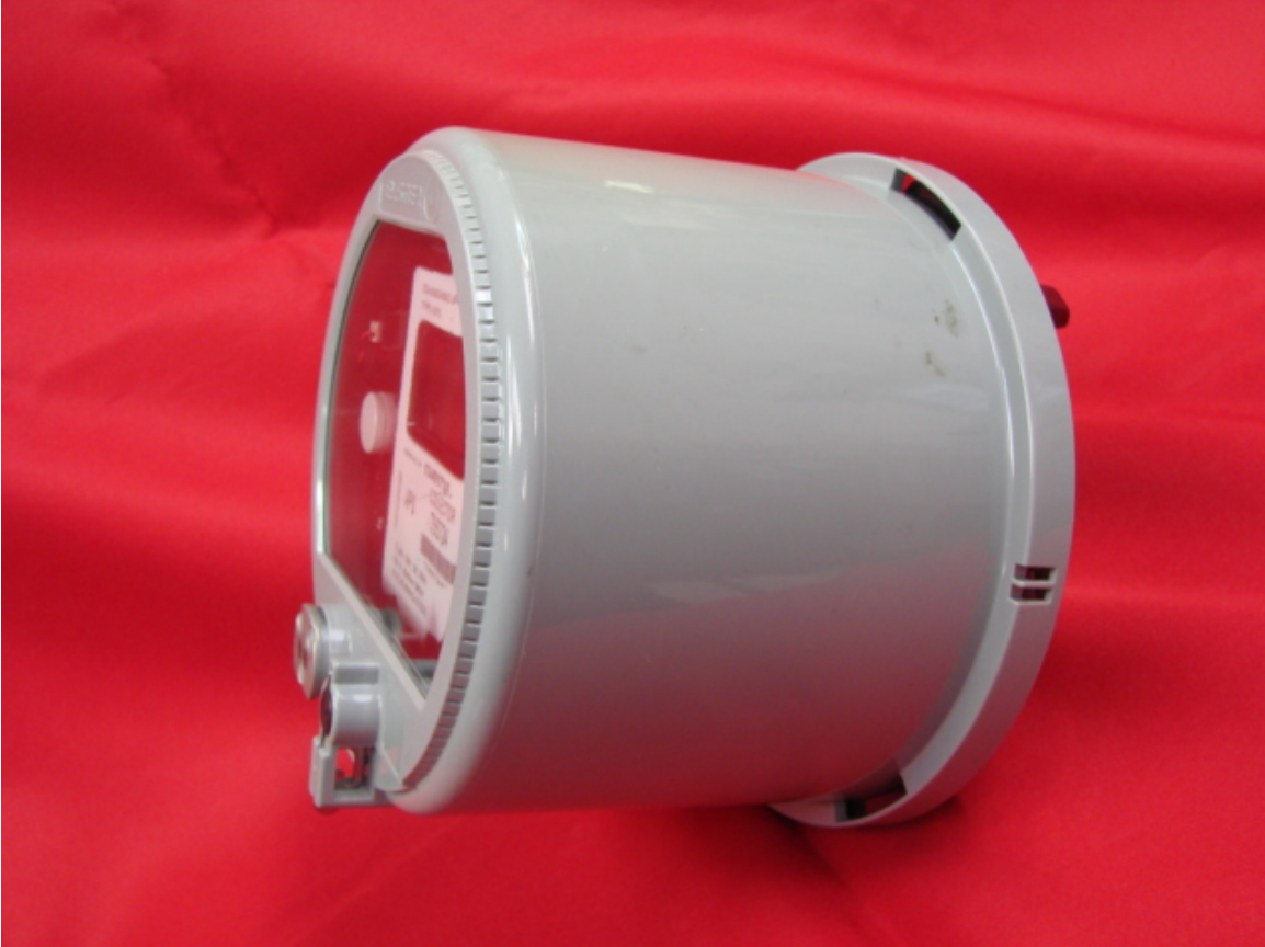
Figure 3: Right Side View