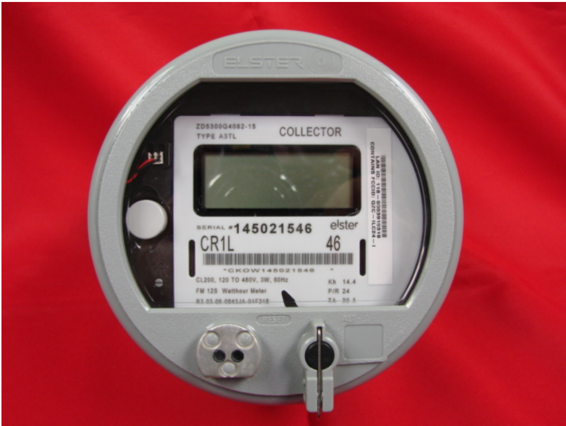
Figure 1: Front View ILC24-I

Figure 1 shows the front view of an A3 meter containing the ILC24 module. The vertically orientated compliance label on the right side of the meter display states, "Contains FCC ID: QZC-ILC24-I."