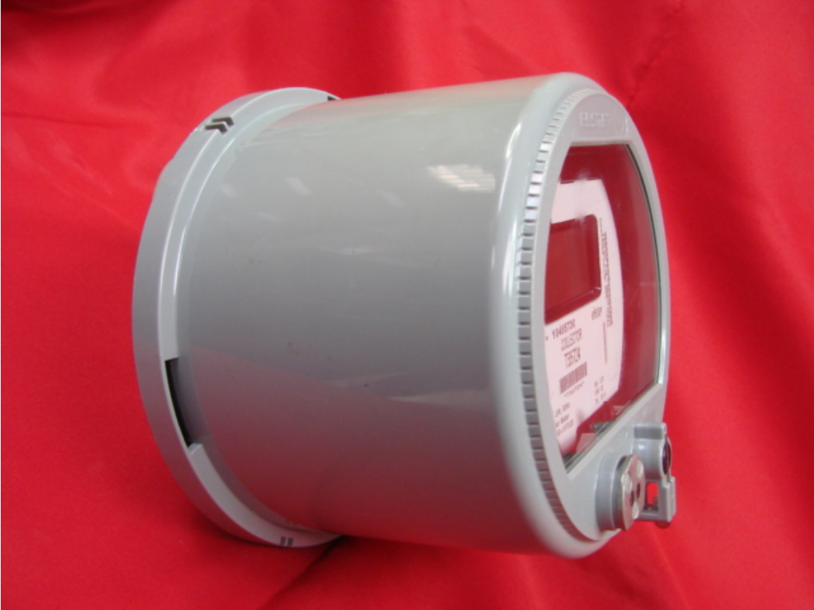
Figure 2: Left Side View